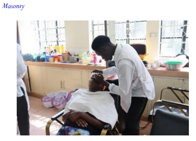
Hairdressing and Beauty Therapy