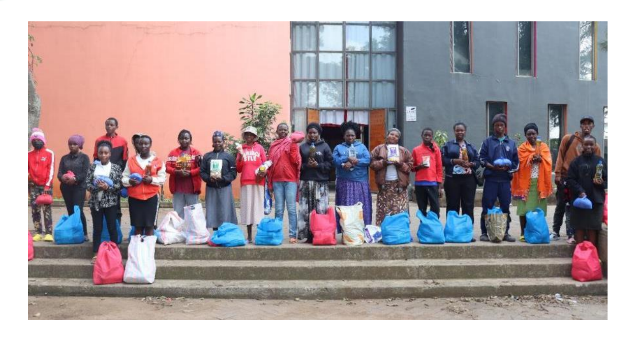
Fondo donates food packages to needy families

The clinic social worker continued to follow up with the sick children under MPC medical support. A good number of these children received medical attention during the year and have fully recovered. However, it's important to note that a few cases of chronic and terminally ill children still need our close follow-up and support going forward. The month also saw a reduced number of clients who received waivers at the Clinic as many families travelled upcountry for the festivities.