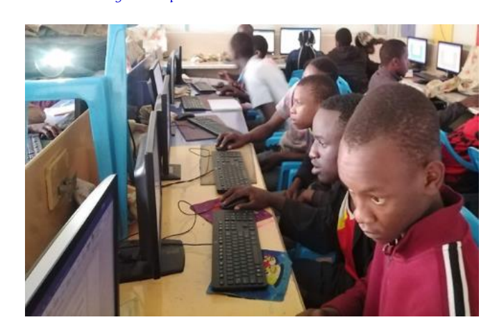
Computer Packages Final Exam