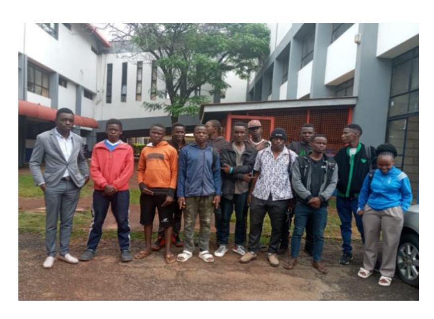
Welding candidates at NITA examination Centre