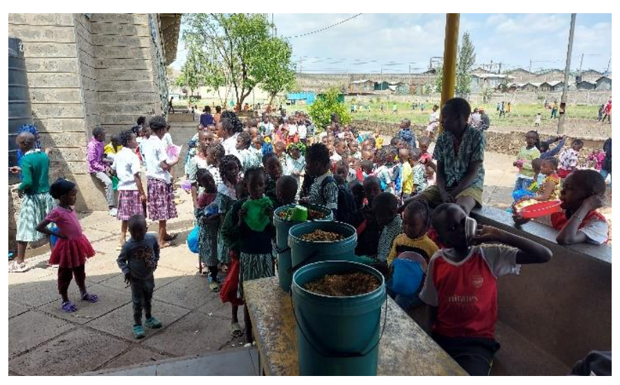
St Elizabeth Primary School Holiday Feeding Program

The four primary schools continued to feed children during the month of December, which they took home to share with their siblings. The program has been beneficial for parents and pupils, and providing the meals means the children reduce the prevalence of anemenia and boost family incomes, paving the way for a healthier and more prosperous future, particularly in times of economic crisis.