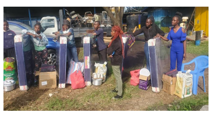
Former Skills students affected by floods and demolitions receive household items and bedding courtesy of the Silent Majority Fund.