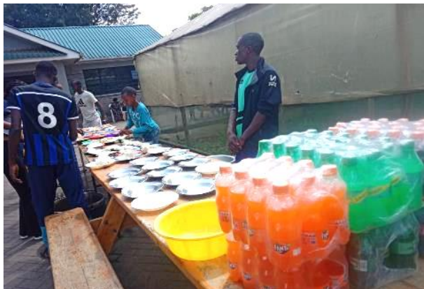
The Lincoln family and friends with donations