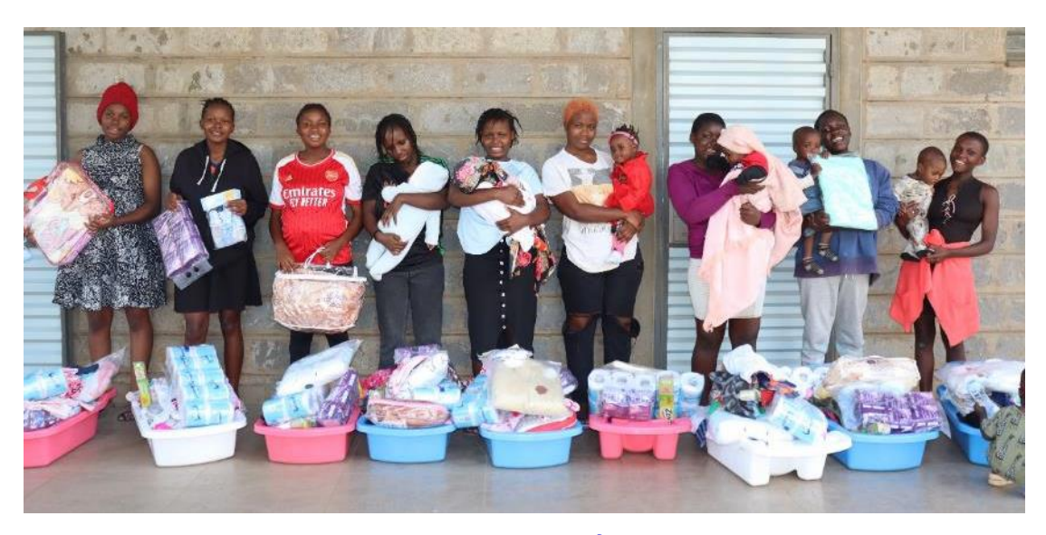
United Nations Women's Guild donated materials for Teenage Mothers and Care Packages

Needy families who sought help were served and supported on a need-basis, with most needs requiring food support and clothing aid. As we approach the end of the year, we are deeply grateful to our donors, partners, and the community members who have generously given their time, resources, and support throughout the year. Your selfless contributions have made a significant difference in the lives of the vulnerable families in the Mukuru community.