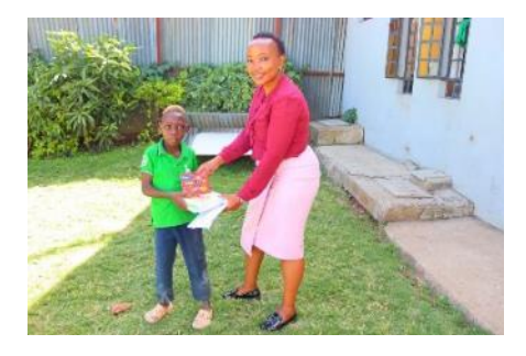
Five children were exited to other institutions and received educational materials for the new year. Two will start at Our Lady of Mercy Vocational Training Centre, two will attend the School for the Deaf, and one will begin at St Catherine's Primary School.