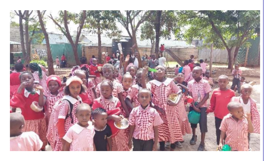
Sancta Maria Primary School Kayaaba Holiday Feeding Program