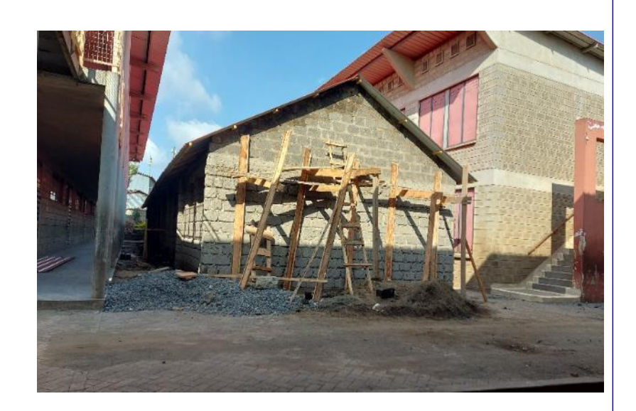
{\it Under \ construction \ St \ Elizabeth \ Grade \ 9 \ Classrooms}