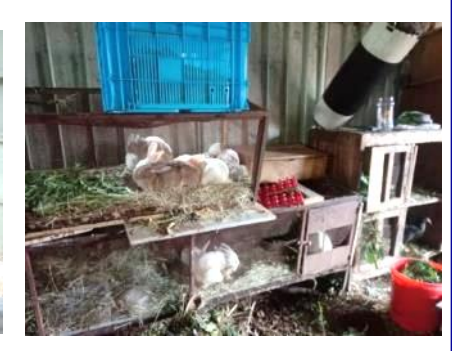
Chicken and rabbits living in the gym temporary.