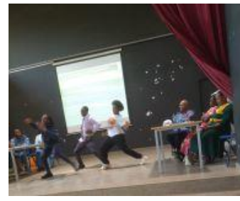
St. Michael's students actively involved with the theme of the African Day Child