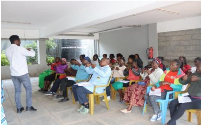
Parent training session

Training opportunities at the Centre are designed to empower staff, students, and community members with practical knowledge about children with disabilities. Our Sign Language classes, conducted 3 days a week for 2 hours, equip participants with a valuable skill. Parents are offered speech therapy sessions to ensure they can effectively integrate the learnings at the Centre into their home environment. These sessions cover the importance of speech, the brain's role in speech production, common speech disorders, and the symptoms of a child with speech challenges, giving parents the tools they need to support their child.