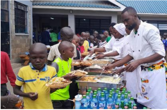
Buffet from St. Charles Lwanga Jumuia