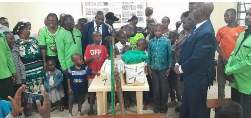
St Charles Lwanga Small Christian community visited the Centre

The Centre extends its sincerest gratitude to all the supporters and well-wishers who have generously contributed their time, resources, and educational materials to assist the boys. During the current cost of living crises particularly, all donations greatly benefit the centre and its services to the boys on multiple levels.