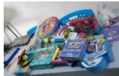
Some of the donated items

The Centre has been receiving local and international donations of different kinds ranging from food provisions to learning materials.