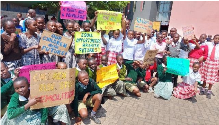
Day of the African Child Celebrations at MPC

The Day of the African Child is celebrated annually in June. During this time, people reflect on and advocate for the rights and well-being of children across the African continent. This year's event, sponsored by the Mercy Education Office and facilitated by the Child Protection Office, focused on the theme ' Education for all children in Africa: the time is now. ' All the children celebrated the day with great pride.