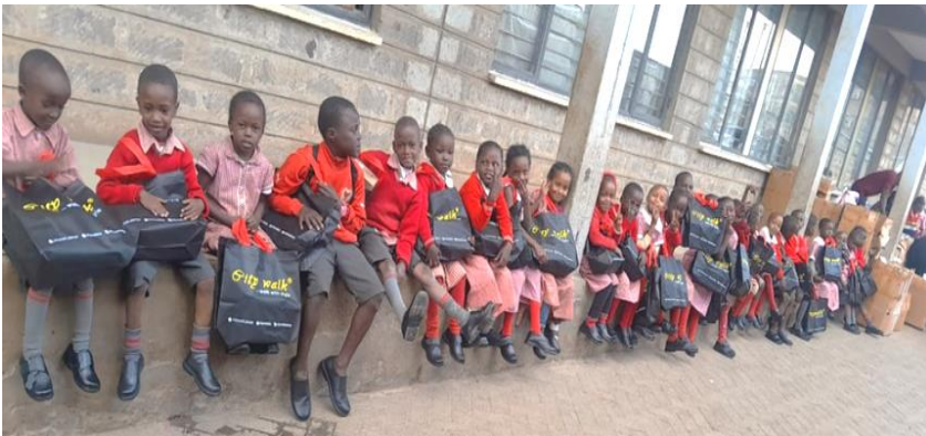
Children love their new shoes from Tuawn!

Some of the children at Sancta Maria Primary School received new shoes as most of them had been lost or destroyed. The shoes will help to reduce diseases as the children walk through lots of rubbish and muddy valley ways to get to school.