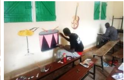
Artists at work

The boys' creative talents have shone brightly in the art classes this month. Their paintings, a tribute to their growing skills, will hang on the walls of the ASKEA Exhibitions Gallery. The art workshop was also busy making bracelets for gifts Ireland's National Symphony Orchestra.