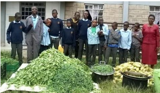
Action in focus