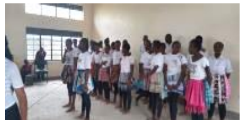
St Michael's cultural troupe at Kingstone Highschool

The Sub-County music and culture competition, a celebration of diversity and talent, was hosted at Dagorreti High School. Fifty students from St Michael's presented a rich array of items, including cultural dances from the Luhya and Kama tribes, choral verses in Kiswahili, and solo performances. The students had a live rehearsal before the competition at the Kingstone High School Gala Show.