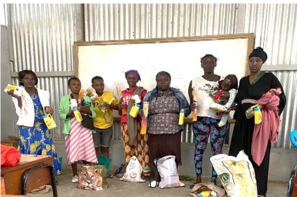
Second Chance Group

During school holiday breaks, sponsored students participate in community service activities at MPC, a tangible way for them to show appreciation for their donors' generosity and to learn new skills. For former prisoners, the transition to life after prison can be challenging, as many aspects of their lives have changed. The Second Chance Program offers community service activities to help them effectively reintegrate into society. These programs are not just about engagement and skill-building; they play a crucial role in preventing reoffending after serving time. Community service activities provide former