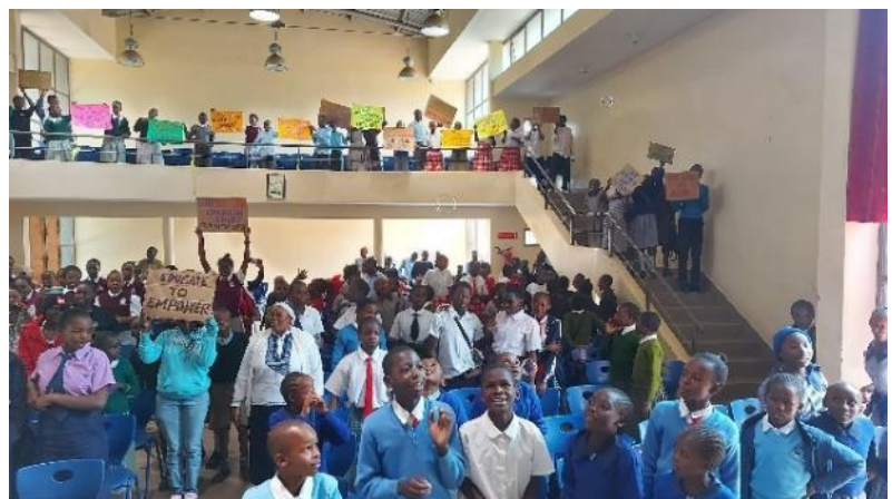
Day of the African Child Celebrations at MPC