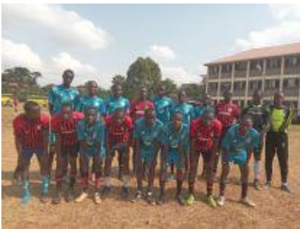
St Michael's Boys Soccer Team

June was a month of remarkable sporting and cultural achievements. Our ball games, including soccer and netball, were played at various venues such as Buruburu Girls, St. Patrick School, Aquinas, Huruma Girls, Wamy Boys, and Highway School. The boys' soccer team's performance was particularly noteworthy, winning one and losing one against the formidable International Schools Sports Association (ISSA) World Champions. The girls, meanwhile, displayed their prowess by winning all the preliminary games, only to face a tough loss to Huruma Girls in the quarterfinals.