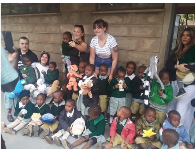
St Elizabeth Children received some toys from the BA crewmembers

St Elizabeth Primary School mother and son were left homeless and without clothes or food after the recent fire destroyed their shanty in Mukuru Kwa Rueben.