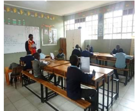
Year 1 class a reading assessment in class

The Day of The African Child festival was held at Korogocho Catholic Church, filled with excitement. The day provided a wonderful opportunity for the boys at the Centre to interact with others, sparking a positive energy and enthusiasm. Such events help bring more awareness for children's rights and care reforms. MPC held its own event where students from all the MPC schools attended and further celebrated with songs, dances and music performances, adding to the festivities.