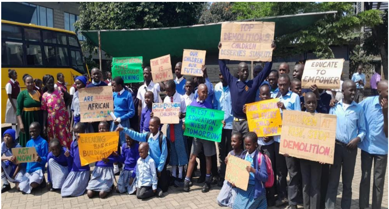
The boys joined fellow MPC students and expressed their concerns to the government after the demolitions and cost of living.

The Day of The African Child festival was held at Korogocho Catholic Church, filled with excitement. The day provided a wonderful opportunity for the boys at the Centre to interact with others, sparking a positive energy and enthusiasm. Such events help bring more awareness for children's rights and care reforms. MPC held its own event where students from all the MPC schools attended and further celebrated with songs, dances and music performances, adding to the festivities.