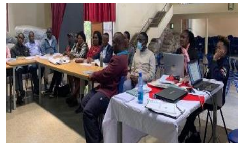
MPC Staff Child Protection Training

MPC prioritizes Child Protection and consistently enhances the skills of all staff. The Child Protection Office takes proactive measures by organizing refresher training workshops for all MPC staff, especially in schools. These workshops serve as reminders of previous training sessions and ensure that policies and procedures remain at the top of all staff's minds.