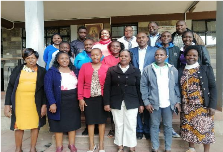
OLMVTC staff and Ruben Centre staff after completion of the TVETA CDACC Training

Recently, the Centre participated in a four-day training program facilitated by the Technical and Vocational Education and Training Curriculum Development, Assessment, and Certification Council (TVETA CDACC). This training, which we believe is of immense value, offered valuable insights into the evolving technical education landscape, introducing new training concepts and emphasizing competency development.