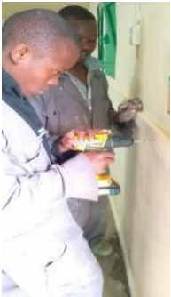
Carpentry boys working in the Askea Souvenir shop

The 63 boys residing at the Centre played a crucial role in successfully participating in all the activities in June. The primary focus of the Centre is to provide integrated, holistic education. The boys excelled in their midterm examinations and no longer fear exams. The carpentry class have been working very hard and are confident they will perform exceptionally well. They are not just ready but eager to register for and take the NITA Grade 3 exams, which is a testament to their hard work and the practical educational approach at the Centre.