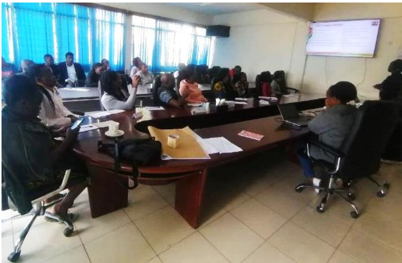
Clinicians Training on HIV/Aids

The clinicians attended a 3-day training course on HIV/AIDS. The training was sponsored by the Centre for International Health, Education and Biosecurity [CIHEB] in partnership with Ministry of Health, where they focused on various topics like management co-infections in HIV/AIDS and new updates measure in the prevention of HIV/AIDS through PREP [Pre exposure Prophylaxis] and PEP [Post Exposure Prophylaxis]. This is a very positive initiative as the information is shared to the rest of the staff through CME [ Continuous Medical Education].