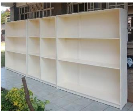
Souvenir Display completed