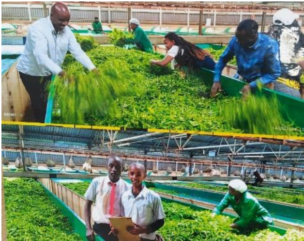
Pupils on Excursion at Kerugoya Tea Factory

Schools highly value educational visits and experiential learning and often organize various learning opportunities outside the classroom. These excursions enhance the learning experiences for students by providing practical knowledge that complements what they have learned in school. This hands-on experience adds significant value to students' learning and can improve their assessment performance. For example, St. Bakhita Primary School recently took 380 students to Kerugoya Tea Factory to learn about farming processes. This trip marked the largest number of students participating in an educational outing.