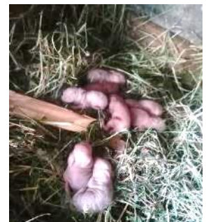
New born bunnies