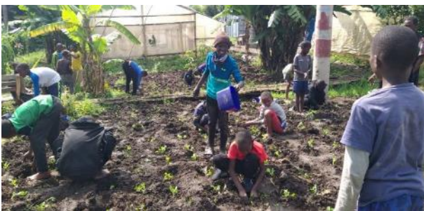
Boys planting vegetables and laying irrigation tubes

The rabbits and chickens are receiving proper care, and the produce from the vegetable patches and greenhouse looks very appetizing. The chickens seem content as they continue to lay eggs daily, and the rabbit population is increasing as expected. Taking care of the animals is not just a task, it's a journey of recovery for the boys, boosting their self-esteem and making us all proud of their achievements. The boys' sense of accomplishment in caring for the animals is truly inspiring and makes us all feel connected to their journey.