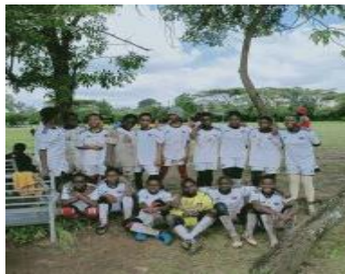
St Michael's Girls Soccer Team