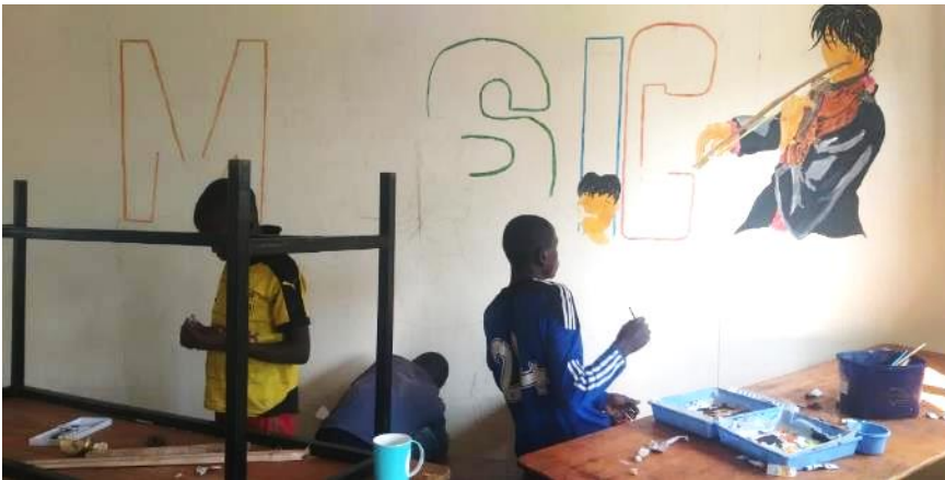
Adding ambience to the music room