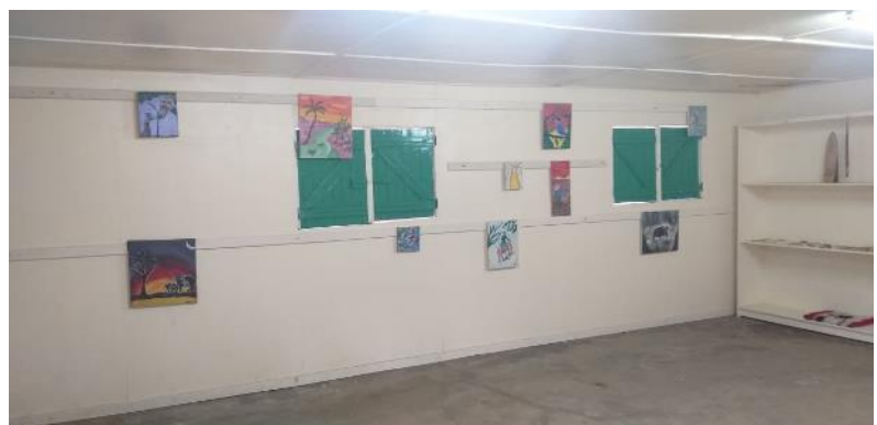
ASKEA Gallery Exhibition room stocked with the boys paintings and artefacts