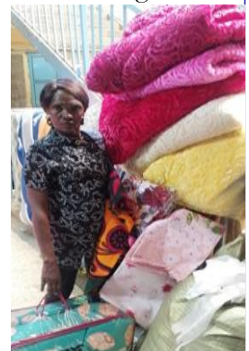
Ex-prisoner with her new business selling blankets.