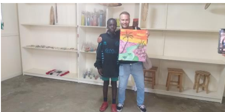
Souvenir shop Up and Running