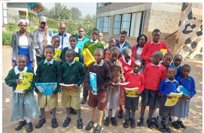
Donation of exercise books and school uniforms to school children