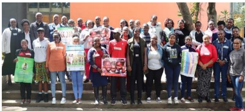
MPC Staff Safeguarding Training

The social workers have been providing ongoing support to students in need at the schools. They have been following up on cases of absenteeism, as many displaced students have had difficulty attending school, some having moved to distant locations. The Child Protection Office has coordinated mentorship sessions and offered psychosocial support to students with behavioural and mental health challenges.