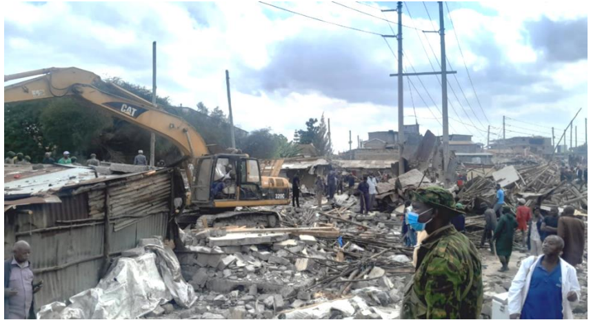
Massai Village behind St Bakhita Primary School

The demolitions, now in their second month, have had a devastating impact on the affected families. Many were caught off guard, lacking the necessary funds to relocate.