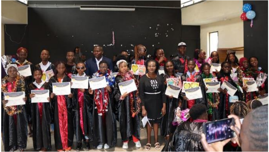
Some of the 2022 and 2023 Graduands.

The Vocational Training Centre held its 14th graduation ceremony on June 28, a momentous occasion where a record-breaking 229 students from 2022 and 2023 graduated. The students received certificates of completion, a testament to their hard work and dedication, while awaiting their NITA certificates. Despite the challenging circumstances in the country, with rioting and demonstrations, not all graduates could attend the ceremony. We extend our gratitude to everyone involved in its preparation and participation, making this event a resounding success.