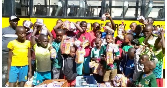
Bread from Our Lady of Mercy Secondary School