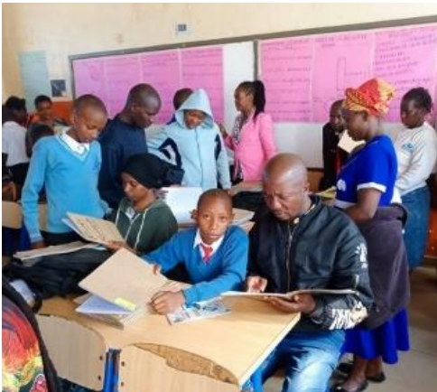
Parent / Teacher Afternoon Meeting

Each primary school held its Opening Mass at the beginning of the new term. The ongoing demolitions continue to cause deep trauma to the children as they are not certain whether they will find their homes in the evening. The local authority still continues to mark more houses for demolition. Sadly, a few children died as demolitions of slum houses were taking place, a sewer pipeline was damaged by the bulldozer and caved in, leaving a gaping big hole that the County Government never covered, and children, being curious, explored without realizing the danger.