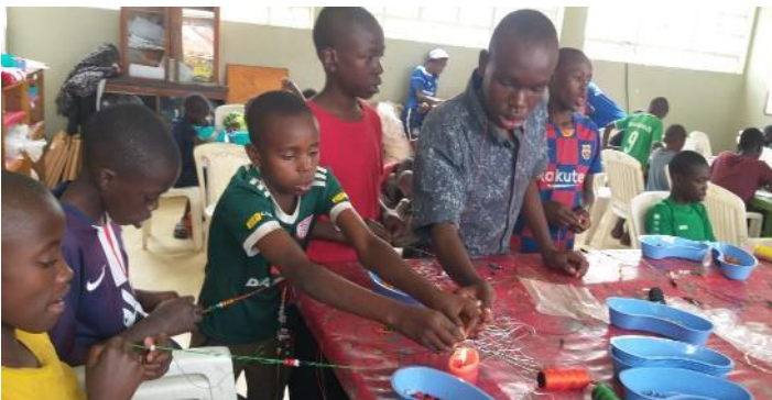
Boys making the bracelets

The boys' creative talents have shone brightly in the art classes this month. Their paintings, a tribute to their growing skills, will hang on the walls of the ASKEA Exhibitions Gallery. The art workshop was also busy making bracelets for gifts Ireland's National Symphony Orchestra.