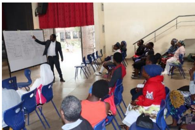
Equity Bank Parents Financial Literacy Training

Furthermore, a follow-up meeting was held for parents of small businesses who had previously received entrepreneurship training to assess their progress and implementation of their new knowledge. The training began last year and aimed to empower young women who own small businesses in the community with financial literacy and management skills. The monitoring indicates that they are all progressing in the right direction.