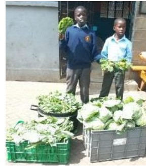
Fresh vegetables from Team Pankaj