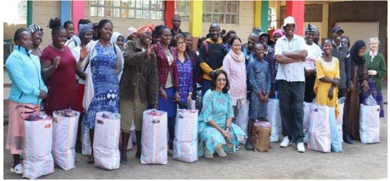
Food parcels and hygiene materials courtesy of Fondo Don Makario's, Raja Foundation and Team Pankaj

Some of the children at Sancta Maria Primary School received new shoes as most of them had been lost or destroyed. The shoes will help to reduce diseases as the children walk through lots of rubbish and muddy valley ways to get to school.