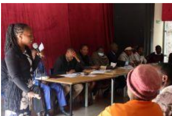
St Michael's 2024 Parents Annual General Meeting

St Michael's Annual General Meeting was held in June. Parents were reminded about the school policies and programs. Based on their examination results, the parents expressed concerns about the students' performance. The school is fully committed to addressing these concerns and working with the parents to improve their academic results. Some of the poor results are the lack of materials like calculators, geometrical sets, and log tables, which parents cannot afford. Not understanding the subject content goes hand in hand with not being able to complete exercises.