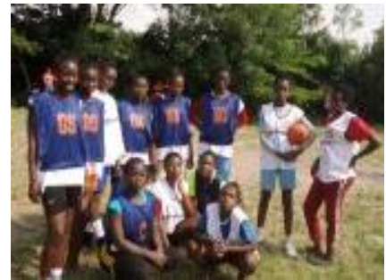
St Michael's Netball Team

St Michael's Girls Netball Team performed well, given that they only started playing in May, to reach the quarterfinals beaten by the National champions from Buruburu Girls.