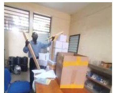
Turn 'O' Metals' laboratory donations