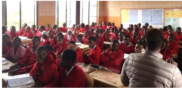
Class 8 talks

The Kenya Certificate of Primary Education (KCPE) took place in November and 561 pupils from the 4 MPC primary schools sat their exams to progress into their secondary education. Prior to KCPE, MPC sponsored motivation talks with the Class 8 candidates to encourage them to prepare well for the exams as well as raise awareness of sponsorship to St Michaels Secondary.