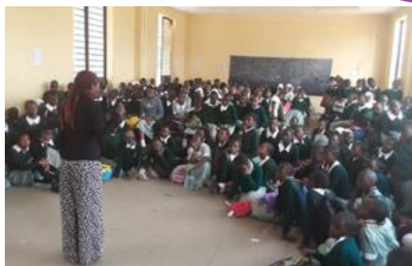
Mentorship Session at St Elizabeth Primary School

MPC social offices are sincerely grateful to the donors who have supported us throughout November with their kind donations. It is comforting to know that all donations are disbursed to needy individuals and families furnishing them with dignity. Through sponsorships the Department has been able to organize uniforms and school gear for needy primary and secondary school students. The Class 8 sponsorship candidates interviews commenced in November to ascertain the needy cases for secondary education sponsorship in 2023.