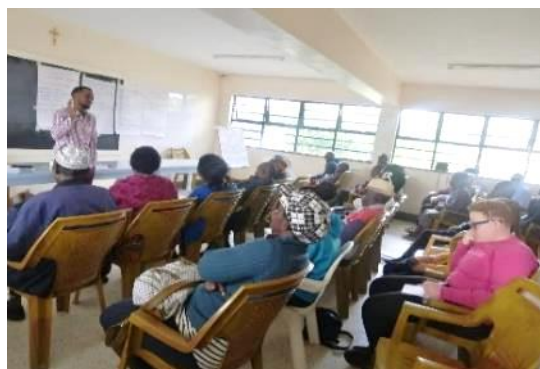
Disability Awareness Training Session