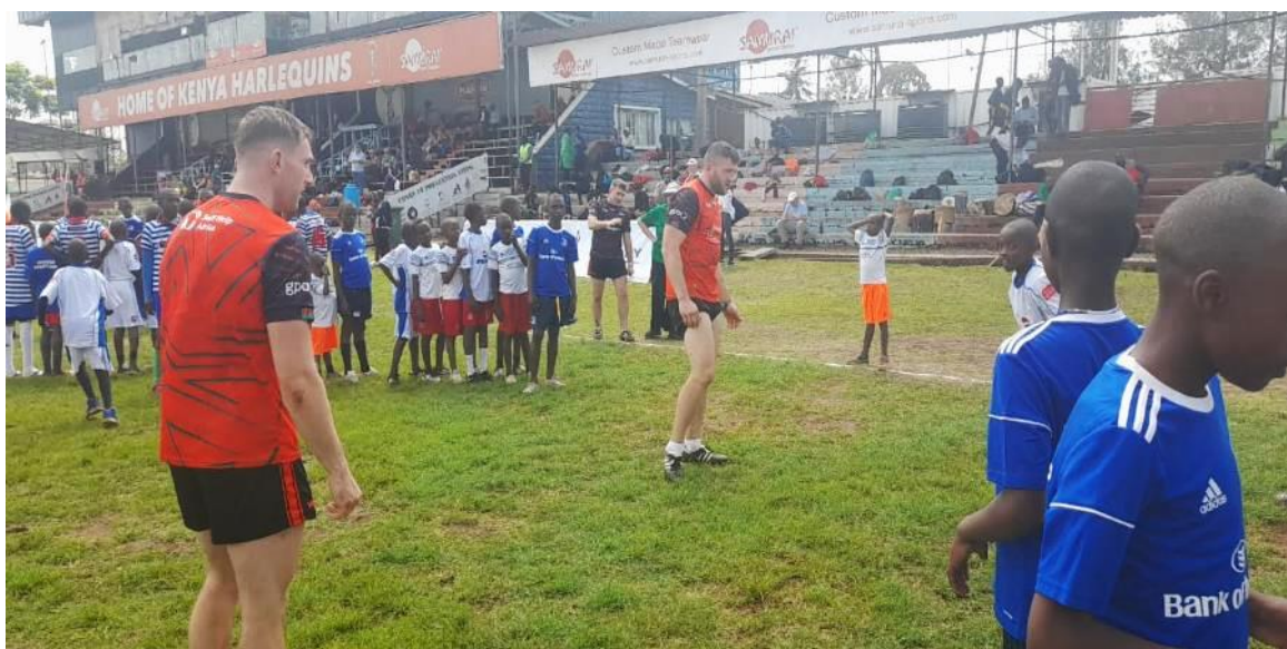
Irish players providing some tips