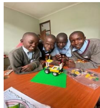
Activities in the Garda Room