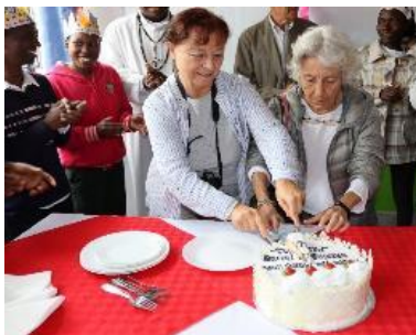
Guests and dignitaries