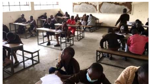
Pupils write appreciation letters.

As the academic year is fast coming to a close the sponsored pupils and students prepare to write their appreciation letters to the sponsors. The letters and academic reports will be loaded onto the database for easy access.