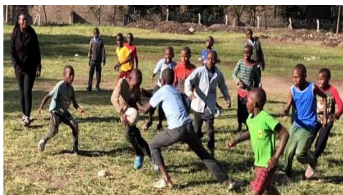
Rugby training at the Centre

The Centre receives much support from Leinster Rugby, Blackrock RFC, Pepsi and Carlow Tag Rugby Associations with rugby gear donations for the boys to participate in the local rugby tournaments as well as their own training sessions. One of the other initiatives supported by the Associations is the employment of a football and basketball coach to ensure that all sporting passions are catered for. The support given by these generous Associations paints a wonderful picture of care and belief in the boys' futures.