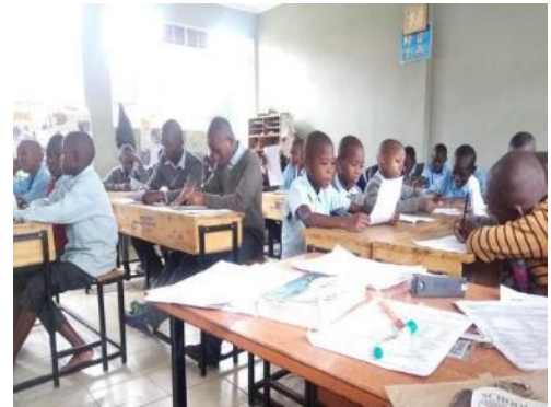
Year One Boys