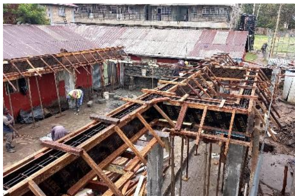
Ring beam completed.

After the Dining hall's foundation was laid the clear structure of the building has started to take shape. November saw the walls and columns erected. Wider culverts were necessary to take away the water from the Clinic that passed under the foundations of the dining hall. The following photographs show the progress of the building. We are very grateful to Frank & Paula Cullen and Friends who have committed to the project which was desperately needed.