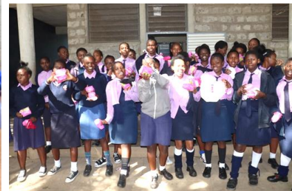
Girls Hygiene Parcels