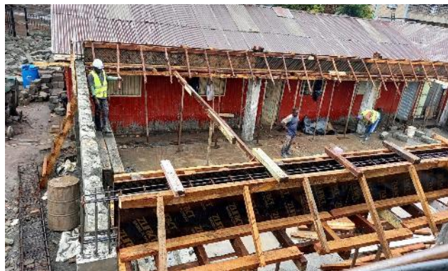
Side walls continued