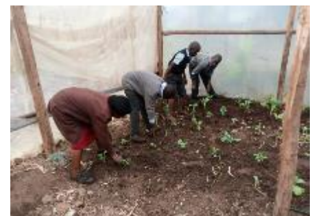
Tending to the vegetables