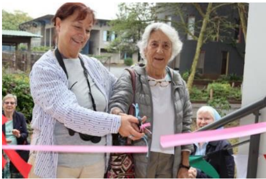
Manos Unidas representatives cut the ribbon