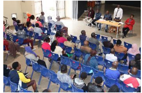
Form 3 Parents Meeting