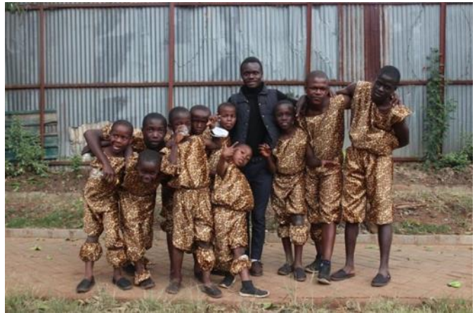
Acrobatic uniform sponsored by Irene Plunkett and Family