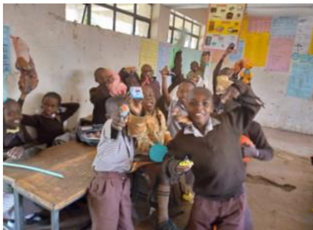
Some very excitable pupils at St Catherine's Primary as they concluded the year.