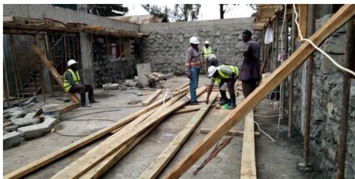
Preparations for the roof beams