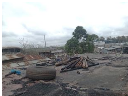
Fire accident at Mukuru Kwa Reuben where some of our students lived.

There was a record number of people who were assisted in November. Normally around 1,800 to 2,000 clients would be helped in some way. Last month there were 1,649 clients assisted. With the impact of the CoVid19 Pandemic the number increased to over 3,000 clients in November with a steady rise in the number of medical referrals. The social and health outreach would not be possible without the stable support from donors and well-wishers.