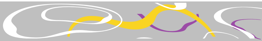
Year 2 Boys

Some improvements have been noted with a few of the boys and we hope that all the learnings will be applied well for the national examinations in December and the others who will sit the National Industrial Training Authority (NITA) examinations.