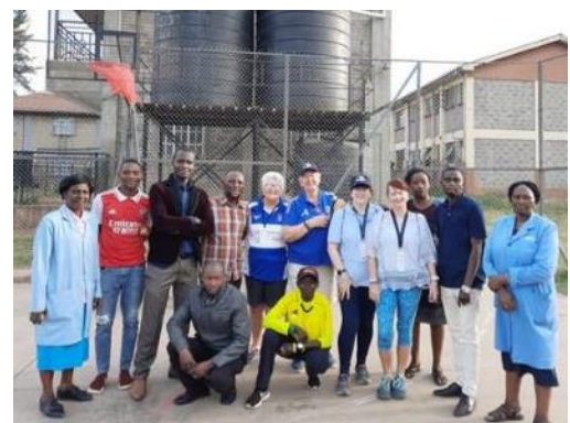
Teachers and Team Coaches