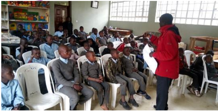
Health and Hygiene Talk

During this time of the pandemic, appropriate hygiene protocols have never been so important. The Clinic staff presented a few sessions on general hygiene, dental care and dangers of drugs.