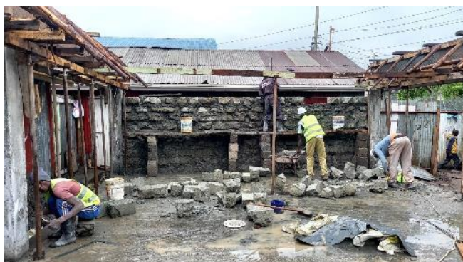
Side walls completed