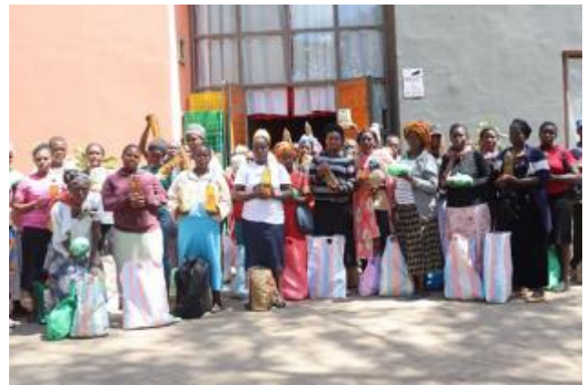
Food Distribution Program

The social offices worked hand in hand with the schools' administration to ensure that the students were fully supported during the national examination period. The guidance, counseling and mentorship sessions were conducted for the KCPE candidates and other students who were breaking for holidays. Over 1,200 girls especially those who were sitting exams were supported with hygiene materials and undergarments so that they were not absent for the national exams as they would not be able to afford them.