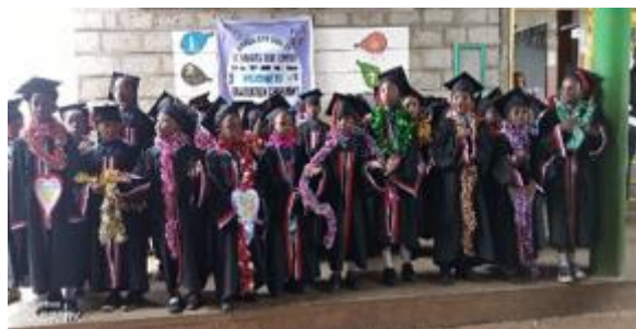
ECDE Graduation Ceremony

The transition process from one stage to the other is a great milestone and the graduation ceremony of the preprimary children was done in style in their respective schools. The young ones were so excited to join primary school. The head teachers, through their speeches, welcomed the pupils to the primary life and promised to take care of them while in Grade one.