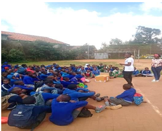
The Clinic staff held health talks with the MPC primary school students.

Sukuma Twende Trust visited Sancta Maria Kayaaba and donated books for the school. We also received a visit from the Tusome program coordinators. The Tusome program, which means 'Let's Read', is a Government initiative in collaboration with USAID that focuses on four key interventions to improve literacy outcomes: enhancing classroom instruction, improving access to learning materials, expanding instructional support and supervision, and collaborating with key system-level literacy actors focusing mainly on Kiswahili and English for pupils in Grades 1, 2, and 3. To monitor its progress assessments are carried out in the schools through the Ministry of Education.