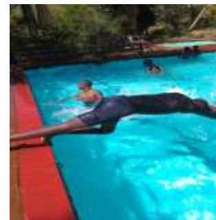
Taking a dive in the pool