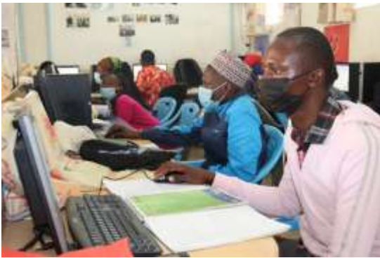
Outgoing Computer students

The students have progressed well as the term has come to an end for most of them and will prepare for examinations in early December. We hope that all the students sitting the exams have studied and prepared well for them.