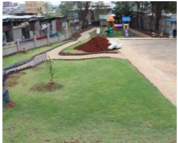
Songa Mbele landscaped area