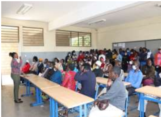
Sponsored Students and Parents

Parents' encouragement in students' academic affairs is vital to ensure good performance. To support parents MPC organizes regular meetings with them on how best to effectively assist the students to do better. The parents are happy for the progress so far and agreed to continue the regular meetings.