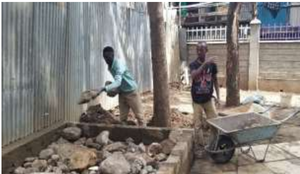
Construction of a water tank base

As part of our commitment to the environment we have a number of large (10,000lt) water tanks for water harvesting. The captured water will be used for the garden and cleaning.