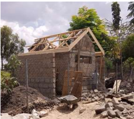
Construction at St Elizabeth and Sancta Maria Kayaaba

A timely addition is the disability toilets in the primary schools. Cheshire Disability Society of Kenya have provided the funding to construct purpose-built toilets to cater for the pupils living with disabilities.