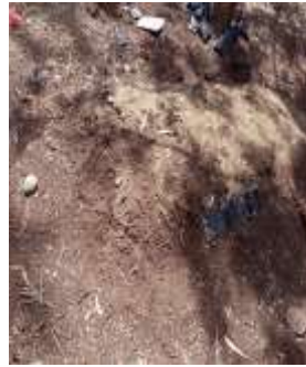
Preparing farm for planting climbers