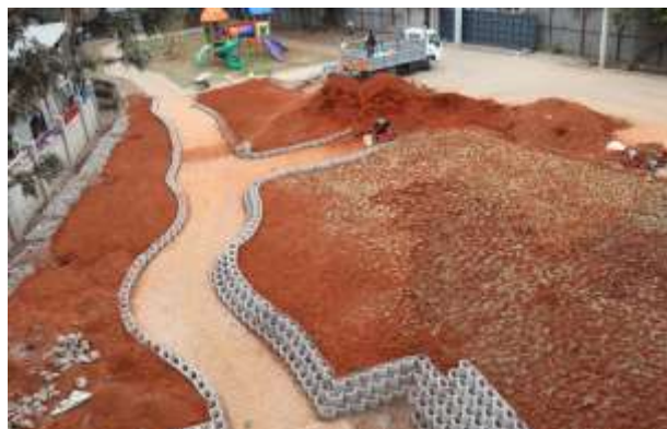
Grass seedlings planted

Although the multi-storey facility was completed in June, there are a few external projects that have been underway since then. Lastly, the landscaping at Songa Mbele started taking shape.