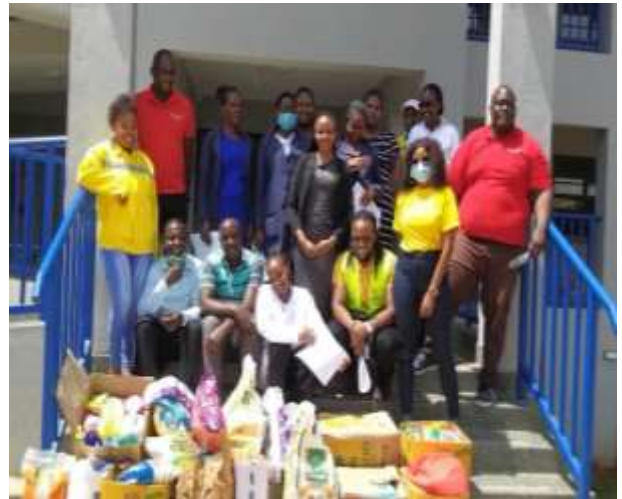
Donations from Vivo Energy

During the month we were happy to receive well-wishers and supporters who donated a number of goods for the Centre.