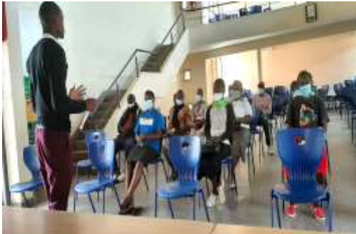
Form 3 class teacher addressing parents

The other activities held involved academic clinics for the Form 3s and Form 4s students; and parent / teacher meetings. Some parents were happy to hear the feedback on their child's performance while others appreciated honest confirmation on the status of their child. For some, a little more focus needs to be applied. There are other parents who did not attend the meetings for a variety of reasons but mainly due to financial reasons as they are scouring the slums for casual work.