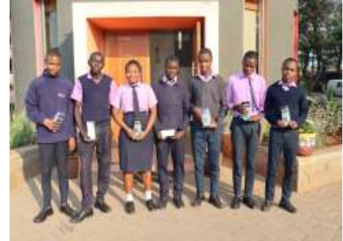
St. Michael's students (Form 4) receive calculators.

The Raja Charitable Trust Foundation donated ten calculators to be used by their beneficiaries during the National Examination – KCSE (Kenya Certificate of Secondary Education) in March 2022. We are delighted by their continued support both financially as well as the food donations to the needy.