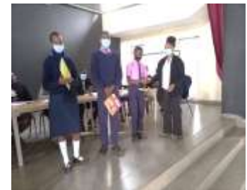
St. Michael's Recipients

St. Michael's awardees received writing materials after the release of the midterm assessments. St Bakhita pupils awardees received revision books. Our appreciation goes to the donors for their support in educating vulnerable students.