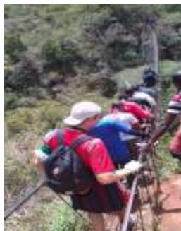
Crossing the steel cable bridge