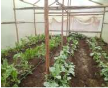
Sukuma wiki in the greenhouse

The boys have worked in the farming project that provides sukuma wiki (kale) and spinach for the Centre. The greenhouse is cared for by the boys and the produce delivered to the cook for their daily meals.