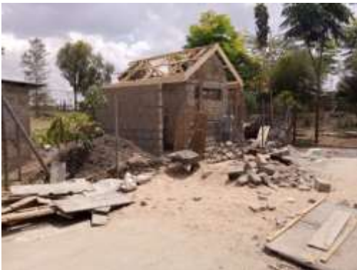
Sancta Maria Kayaaba

Cheshire Disability Services Kenya provided funding to build disability friendly toilets in the primary schools. We are thankful that the construction has commenced and more importantly that the children will be able to access the toilets easily.