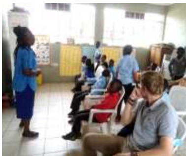
Year I (Std 1-3)