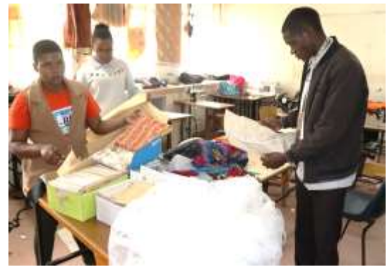
Dressmaking students peruse through donated sewing patterns

The Skills students received donated clothes and shoes by various donors. The Hairdressing and Beauty class along with the Special Needs students had the highest number of vulnerable students hence they benefitted greatly. It was a joyful activity as students selected from a heap of clothes provided. We thank all those who donated the goods.