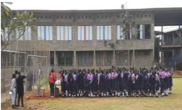
Girls mentorship in progress and issuance of sanitary towels.

The girls had an opportunity to receive sanitary towels from their mentors.