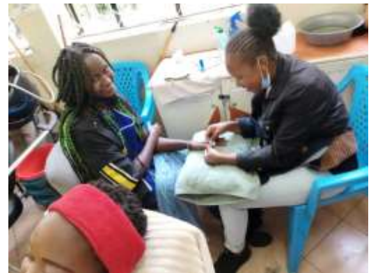
Hairdressing and Beauty Class