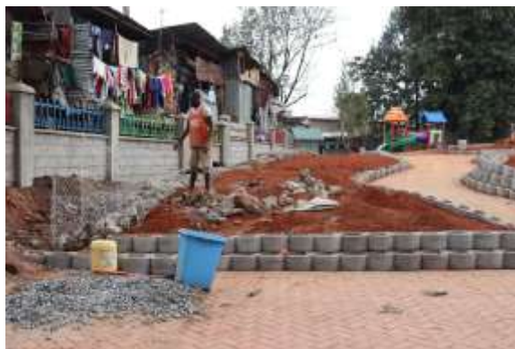
Gabions to reduce flooding