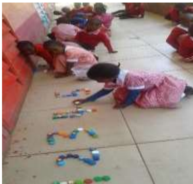
Pre-primary children at Sancta Maria Kayaaba enjoy their learning.