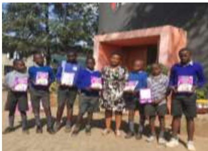
St Bakhita Recipients

Through generous donations we managed to distribute learning materials to St. Bakhita Primary and St. Michael's Secondary School students who performed well or showed great improvement.