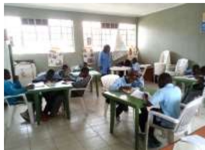
Year II (Std 4-7)