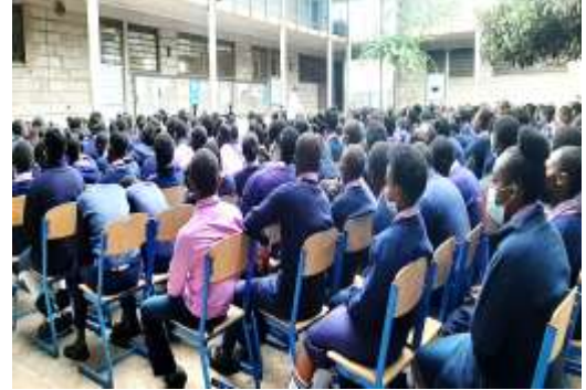
Mass in progress at St. Michael's

November marks the mid-point of term 2 in the 2020 academic year. The classes continued with mock and mid-term examinations during the month and the enrolments remained steady. The month commenced with a whole school Mass celebration.