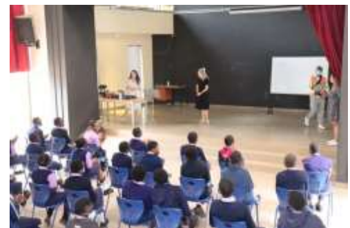
Encore for Students