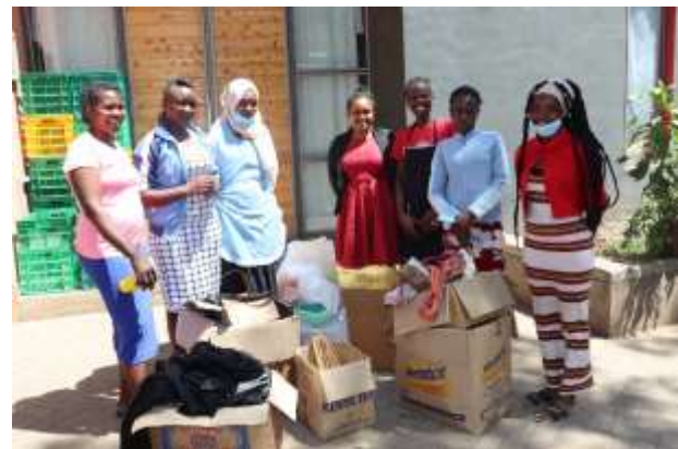
OLMVTC Students receive donations of clothes and shoes