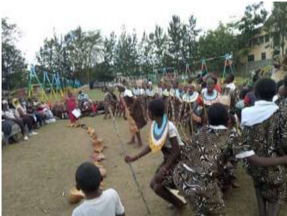
Grade 3 pupils perform a cultural dance

December was made colourful by the cultural activities held in schools as a requirement of the Competency Based Curriculum (CBC). The Grade 3 pupils showcased foods and dances from different tribes guided by their teachers.