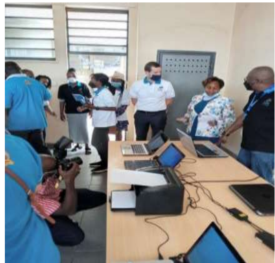
Donated laptops for Sancta Maria Kayaaba

Sancta Maria Primary received 5 laptops and 4 desktops from East Africa Packing Industries to support the digital literacy component in the CBC. The size of most classes at Sancta Maria Primary is around 50 -60 pupils. The IT donation helps to expose the pupils to computers and assists them to complete the assessment which is based on computers but it is a constant struggle to achieve a balance between the needs and demands of the CBC. Clearly more teaching resources and learning materials for the new curriculum are still required in the 4 MPC primary schools. However, it is a start and we are grateful to East Africa Packing Industries.