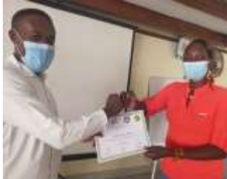
MPC Clinic nurse receives her certificate after completing the Multidrug resistance tuberculosis training program.

It is with gratitude the Clinic reaches the end of another year serving the very sick residents of Mukuru. We hope that 2022 will be kinder and that the pandemic will cease. In December the Clinic treated over 1,000 patients. The Sub-County TB Coordinator visited the Clinic to follow-up on the TB Management Survey. The Ministry of Health (MoH) has created a new mobile App [‘T-Bu lite] to assist in TB patient management. The App will enhance the efficiency of patient care and contact tracing. When a patient is diagnosed with TB ensuring that the patient maintains the regular medications and check-ups is very important. It will also improve the record keeping and reporting. Training was provided by the MoH so that the nurses are kept up to date with the latest guidelines and healthcare in Kenya.