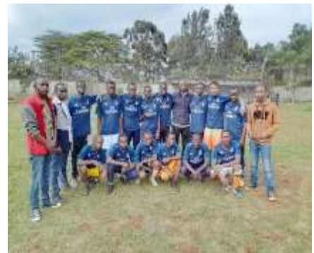
The boys' soccer team pose for a photograph before the battle

When the students return in January that will signal the beginning of Term 3 and the last term for the Form 4 students. The other students have quite a few more lessons to cover before they complete their secondary education. Next year will be the last year of the staggered terms due to the CoVid19 Pandemic.