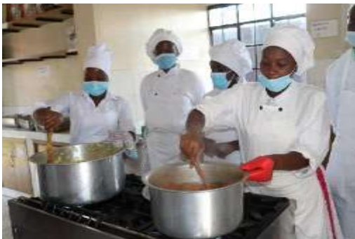
Catering students prepare lunch for guests