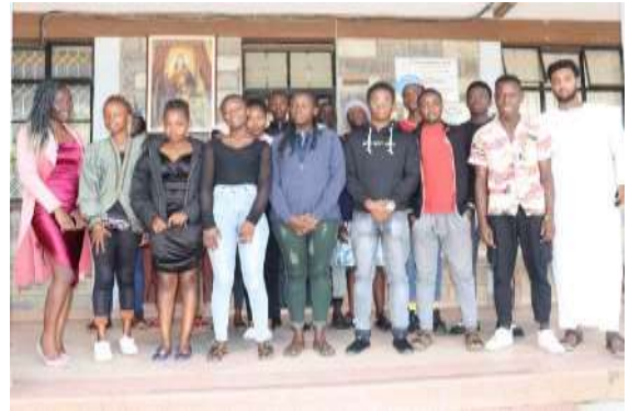
Outgoing Computer students