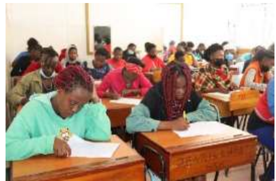
Hairdressing exams in progress