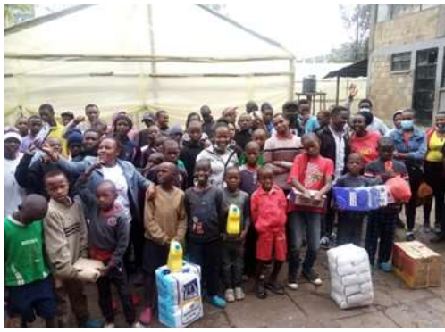
R.T.I. Students donate provisions to the Rehabilitation Centre