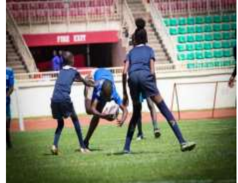
MPC Rugby Team