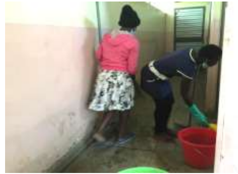
Students engaging in community service

We are appreciative of our donors who continuously sacrifice to contribute towards educating the needy. For this we understand that the only motivation they would require is for the students to behave well and perform exemplary in school.