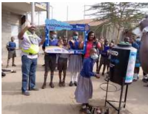
President of the Rotary Club displaying hand washing steps

The Magharibi Rotary Club visited St Bakhita Primary and held a hand washing event where they demonstrated the correct hand washing steps and encouraged the pupils to wash hands regularly to reduce any form of illness especially CoVid19. The Club also planted 50 trees in the compound and promised to plant different fruit trees as well.