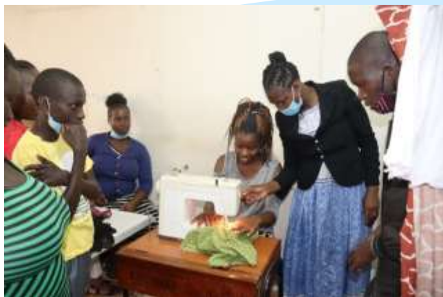
Dressmaking students try out the donated sewing machine