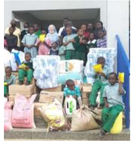
Donations from Kamani Foundation