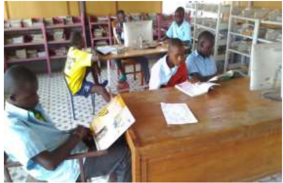
Reading in the library

Many schools in Kenya do not have a library but the Rehabilitation Centre has a spacious one fully equipped with computers, books, and other resources, thanks to the generous donors. Called the “Washington T Booker” library, it is named after the African American educator, author, orator and adviser to several US presidents. His story provides great encouragement.