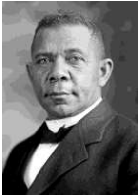
Washington T Booker

Many schools in Kenya do not have a library but the Rehabilitation Centre has a spacious one fully equipped with computers, books, and other resources, thanks to the generous donors. Called the “Washington T Booker” library, it is named after the African American educator, author, orator and adviser to several US presidents. His story provides great encouragement.