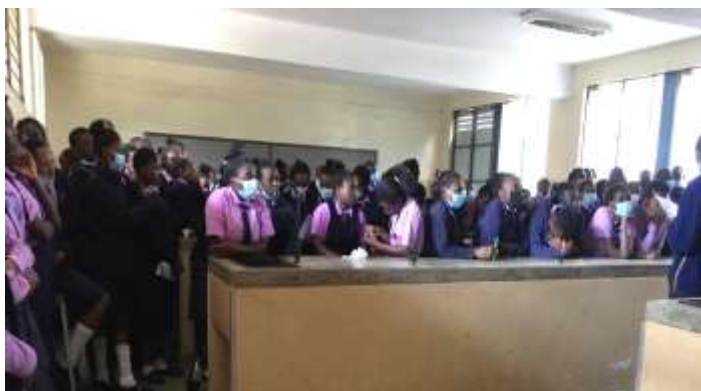
Sponsored students meeting

There has been a persistent record of poor grades with our sponsored students, which has been a consistent trend. As a result, we realized that owing to the present economic situation in the country, many poor parents in the slums are forced by circumstances to saddle the young ones with chores like hawking wares and other menial jobs around the house before and after school. Domestic chores like these no doubt help to train the children and make them realize that they can and should contribute their own quota to the general upkeep of the family but what a responsibility on such young shoulders. Sadly, this has impacted negatively on their performances and we called meetings for both parents and students. The two most vital subjects are Maths and English. To boost their overall performance, students were given exercise books for revision, to practice Maths on a daily basis. The students have a private study period after lunch to complete the exercises.