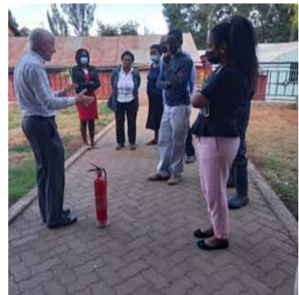
Fire Extinguishing Training

The demolition of hundreds of homes continued to make way for the new roads through the slums. The latest village is Sinai which is near the airport side of Mukuru slum.