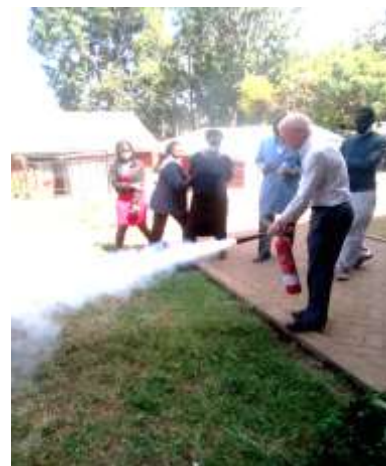
Demonstration on fire extinguisher use

The number of patients attending the Clinic has remained constant over the last month. There were two major trainings during October. Firstly, following the acceptance of the Ministry of Health's invitation to attend a HIV 'Dolutegravir' training, the Clinic sent one nurse to attend. We hope that the training will better aid our service delivery to the Comprehensive Care Clinic in regard to ARV administration. At another time all the Clinic staff were taken through the fire equipment training at the Rehabilitation Centre.