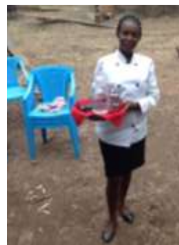
Catering Class in action