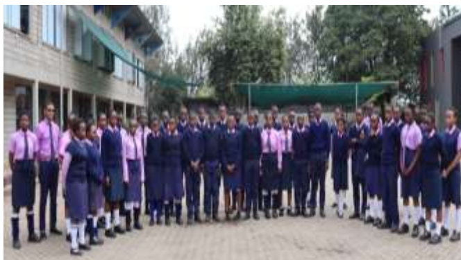
Full Student Leadership Team

The social worker supported a number of students after some had lost their parents during October. There were also 8 students who required medical attention with minor ailments. It is very fortunate for our students who can be treated at the Clinic without charge. Other students were supported with uniform aid and home visits.