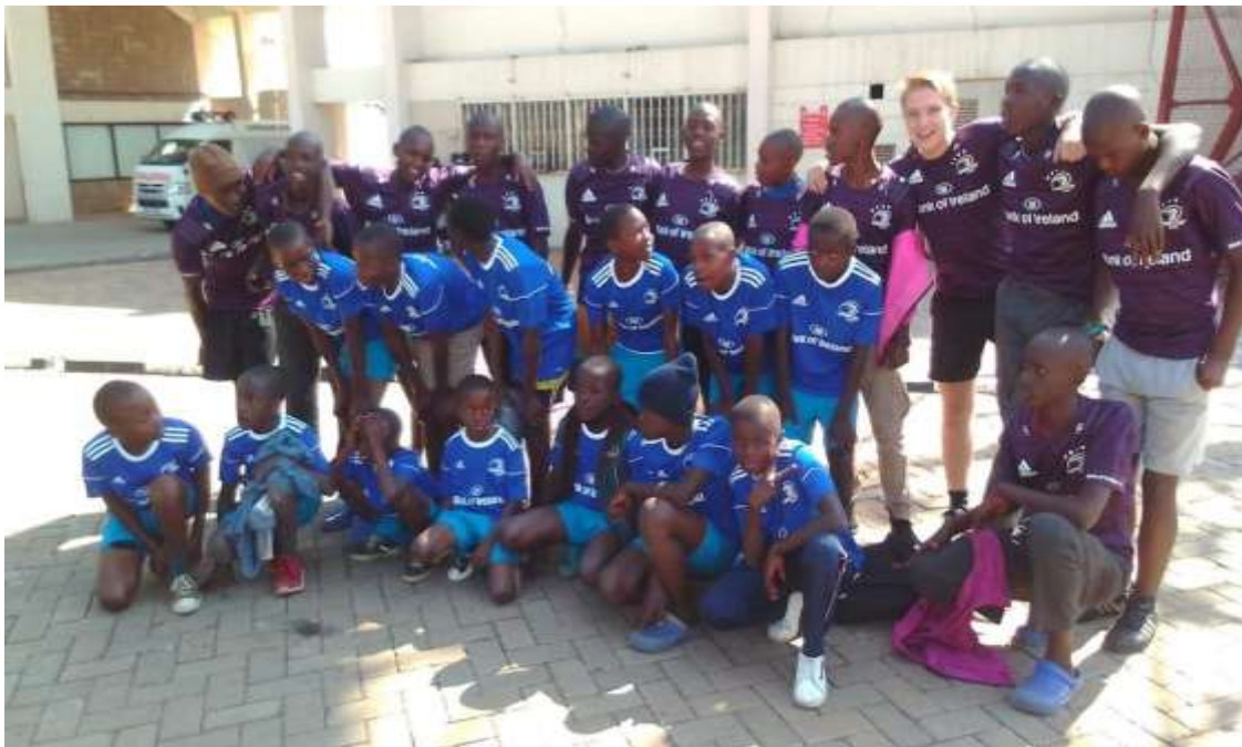
MPC Rugby Team at Nyayo National Stadium