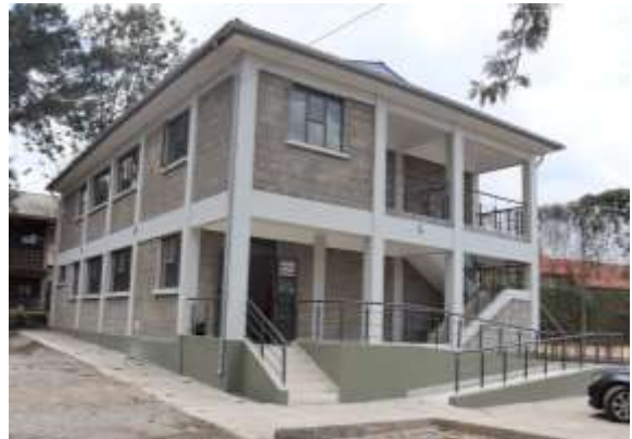
Skills Therapy Block Building