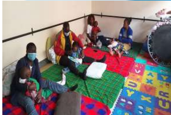
Parents learning new therapy techniques

On the operational side, October demonstrated lots of good learning and plenty of activities. Many of the children have shown great improvement in different areas. The attendance which does make a big impact on the children's achievements has been stable, as the parents have been supportive in meeting the children's individual learning goals.