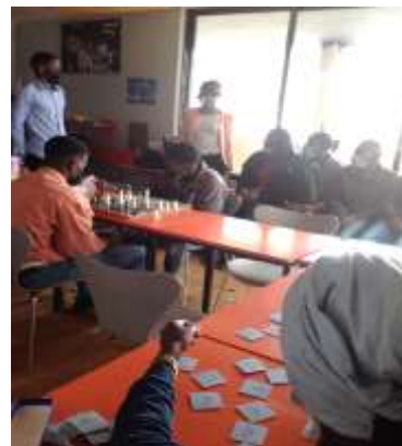
Front Office students interact with staff at Alliance Française

Currently there are 241 students enrolled in one of the 8 vocational training courses at the Centre. The gender equation is 56% female and 44% male with the computer packages course the most popular, followed by Hairdressing and Beauty.