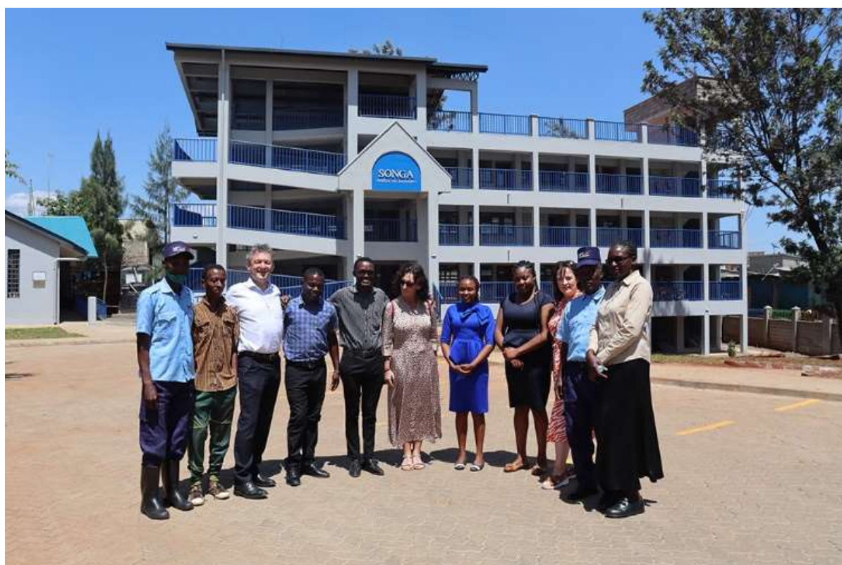
Kenyan Child Foundation representatives with some Songa staff

The Kenyan Child Foundation representatives visited the new facility and met with the staff, children, consultants as well as the contractor. They were very pleased with all the wonderful work that happens each day. The new facility makes it an absolute delight as the children's smiles are so big when they arrive in the mornings that everyday is such a blessing. The children performed a number of skits for the visitors. The official opening will be held in 2022 so that more of the donors can attend.