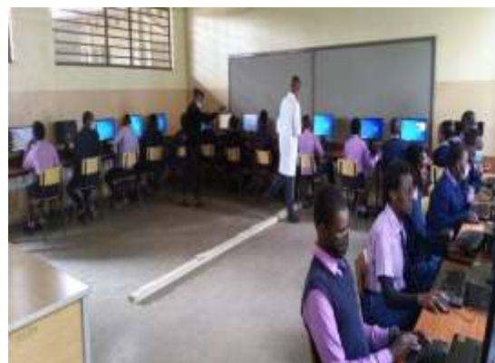
Upgraded computer laboratory

St Michael's has two science laboratories which places it among the top 10% well-resourced schools in Kenya. Additionally, the new computer laboratory was established in 2018 with a completely new installation of cabling to maximize the number of functional computers to 38. Like all things electronic it has a finite life. Absa Bank, through its Computers for Schools (CFS), upgraded the laboratory and provided 20 new computers for the students. The upgrade provided the Form 4 candidates to undertake their KNEC examinations with ease.