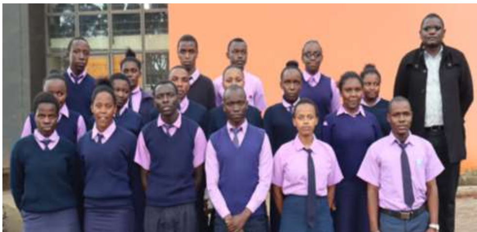
St Michael's Senior Student Council 2021

The new 2021 Student Council were commissioned after the student elections. The new Student Council received further training at the Passionists Retreat Centre in Karen, courtesy of Mercy Education Office. The student leaders had an opportunity to interact with other student leaders from Mercy associated schools.