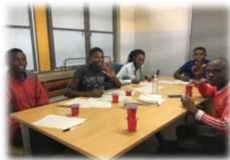
Macheo Students 2020 KCSE Results

The Form 4 Macheo students completed their KCSE examinations in April and the results were released in May. The Macheo Program is sponsored by Strathmore University. After sitting exams for selection, the top ten students from Form 2 are mentored until they complete the KCSE exams. The commitment requires the students to attend a number of Saturdays throughout the years over the 3-year period to improve their potential and opportunity to gain entrance into a university. St Michael's and Strathmore have collaborated to provide this opportunity for the students since 2016. We congratulate the students on their commitment and dedication over the last 3 years.