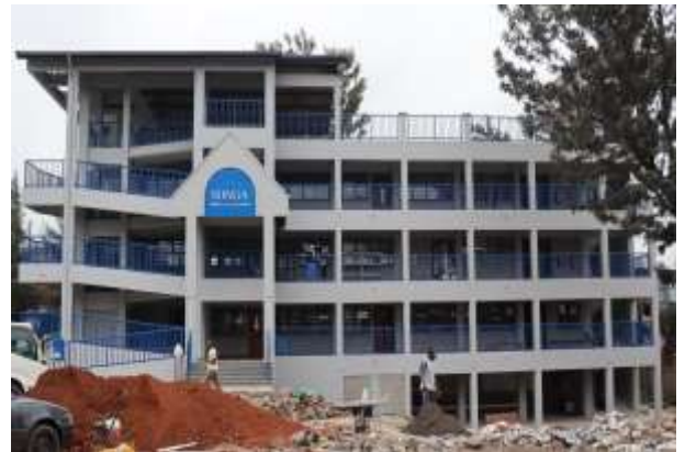
The New Facility at Songa Mbele na Masomo nearing completion.