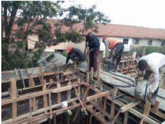
The first floor ring beam concreting