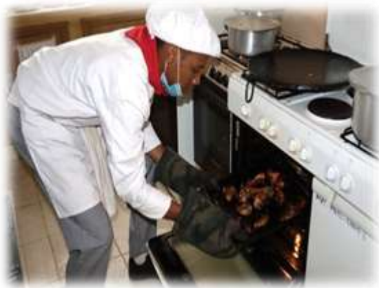
NITA (National Industrial Training Authority) examinations in progress