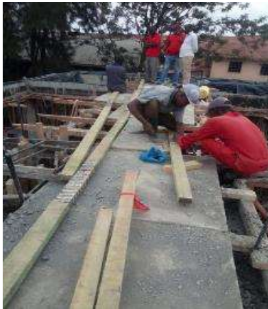
Trusses sample preparation