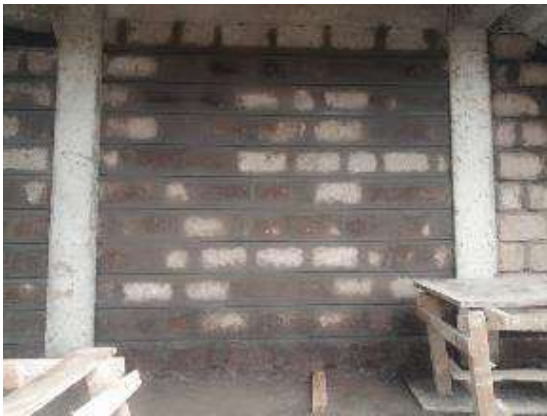
External wall finishing

Affectionately known as the Therapy Block, the “ Vocational Skills Education and Therapy Centre for Youths living with Disabilities ” has marked its 38 th week in construction. There was a delicate balancing act to re-negotiate contracts since the original company closed its doors as a result of the CoVid19 pandemic. This automatically extended the number of weeks required to complete the building as phases of the construction needed to be approved by the various consultants. The major activities that proceeded during the month included the internal and external plastering, first floor ring beam, removal of formworks and ramp preparations.