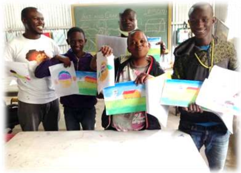
Delighted with their achievements.