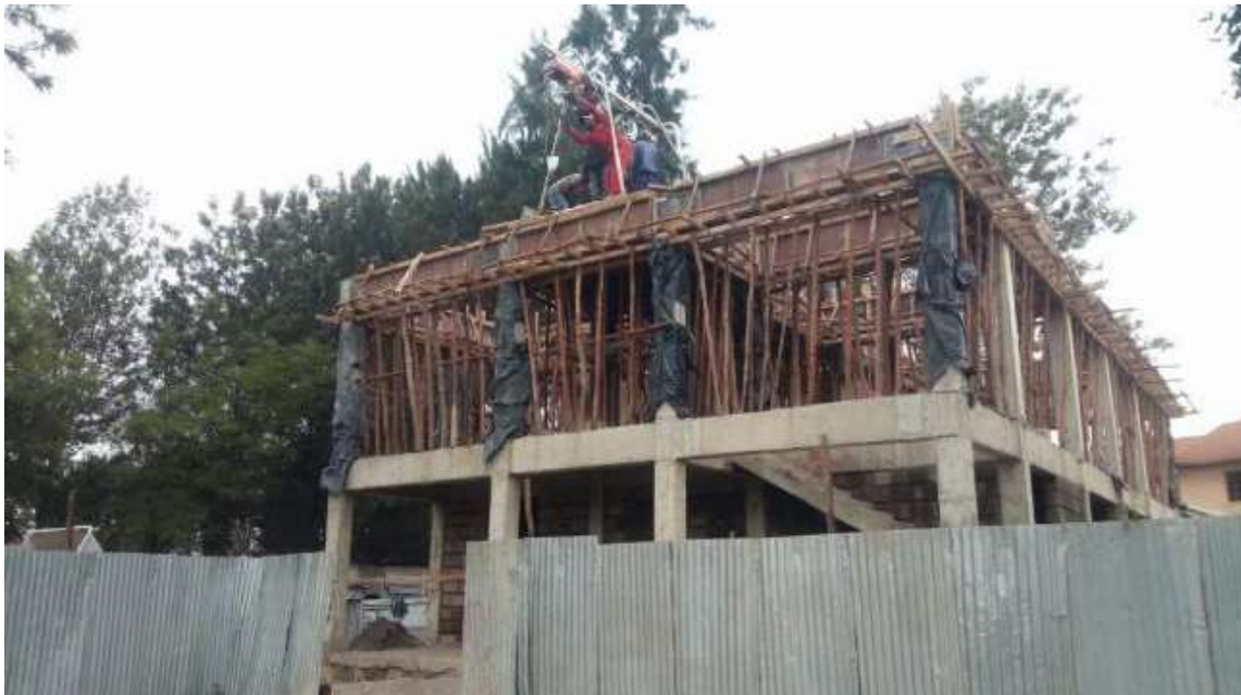
Removal of formworks to allow for curing.