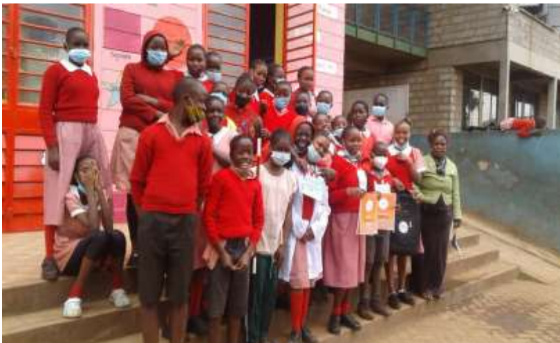
Teachers and pupils from Sancta Maria Primary School raising awareness.