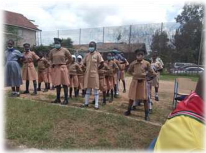
St. Bakhita Primary School held a graduation ceremony for their Scouts.

The extracurricular activities are a vital element in any child's development. There were a few major activities during the month.