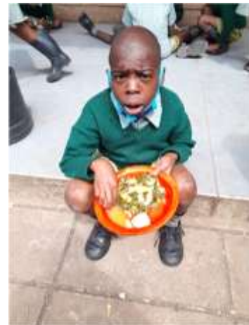
St Elizabeth Primary pupil enjoying his lunch.