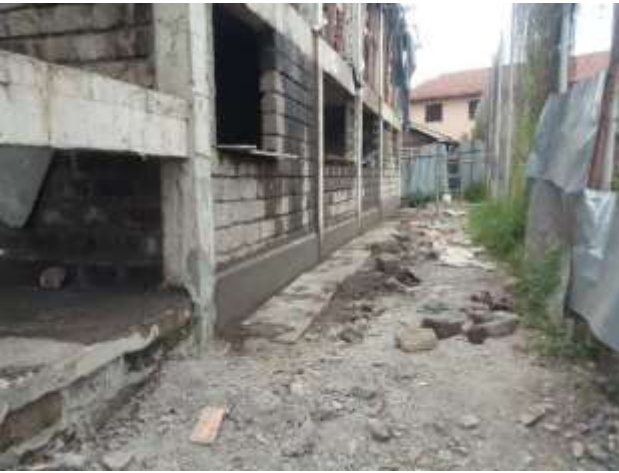
External plinths – (back / courtyardside)