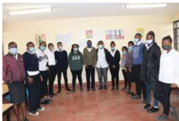
New enrolments for Hairdressing and Catering courses