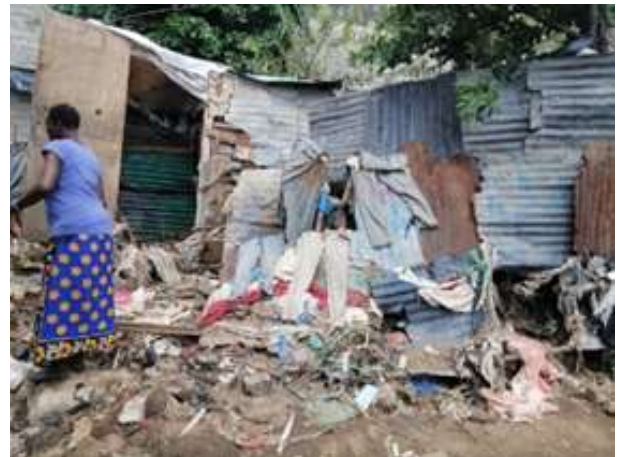
Houses were swept away and hundreds left homeless