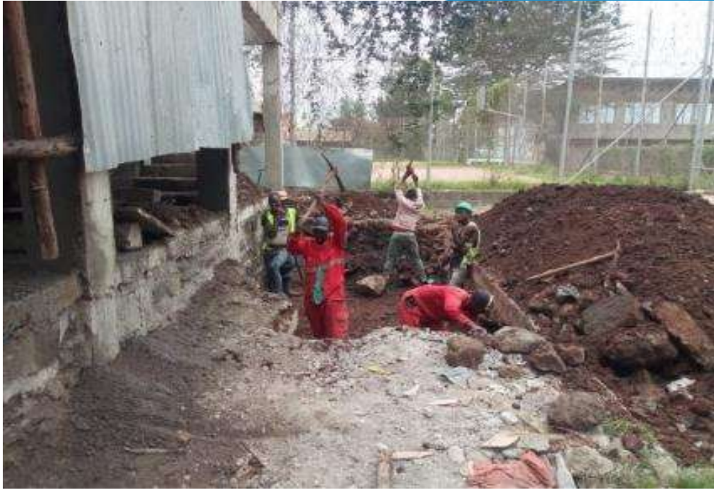
Ramp area excavation in progress