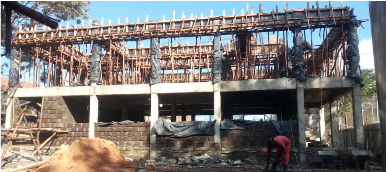
Side view of the new building