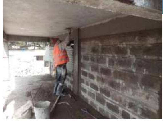
External column plastering / finishing