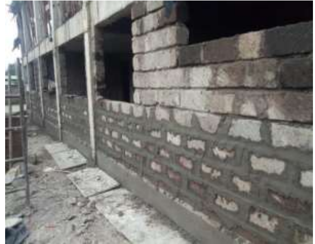
Key pointing on external walls.