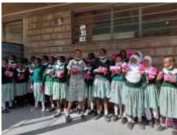
St Elizabeth Primary School girls receive sanitary towels to help boost school attendance.