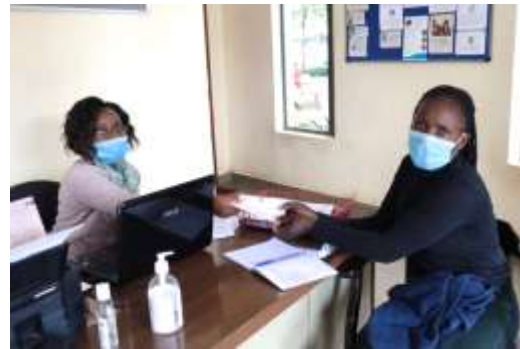
Parent receives the School Fees cheque from the Sponsorship Office.

The 2020 academic year’s third term for Form One to Form Three students commenced in May. Students were busy organizing themselves submitting their fee structure to the Sponsorship Office for payment.