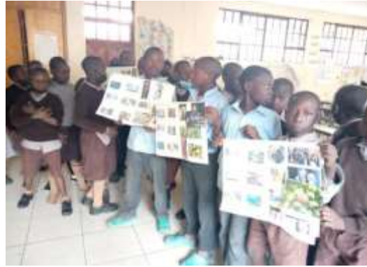
St Catherine's Primary Grade 3 pupils showcasing their projects.

Year Ones are now comfortable with reading and writing simple sentences. They can now read short stories and answer oral and written questions. These boys are also improving in Maths and Kiswahili. Grade Three boys have been preparing for their KNEC assessment which will end on 3rd June 2021. They have been taking preparatory lessons at St Catherine's where they are registered for the assessments.