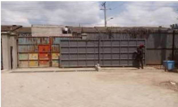
Main sliding gate

After 55 weeks of construction work the new educational facility is nearing completion with the various final touches the main activity. We hope the handover will occur on 3rd June with the children returning on 10th June. The week in between will give the staff time to put the furniture in place for the children's learning. The kitchen is the major work that will take a few extra weeks to complete. The temporary kitchen will be demolished once the new one is operational. The external works on the pathways and sensory garden will also take a few more weeks to complete; however, it won't hinder the classes commencing.