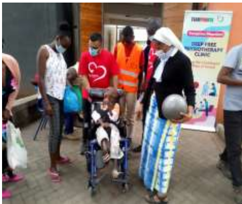
Physiotherapy sessions at the MPC multipurpose hall.