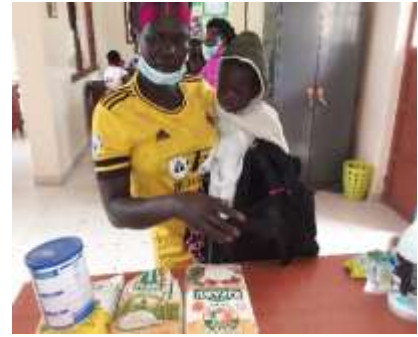
Flood victims receive essential items