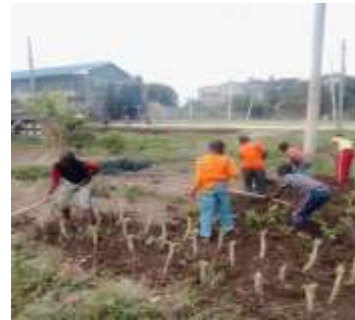
Preparing and planting

The reintegration program continues to gather pace. One boy recently completed his KCPE exams and will return to his family so that he can finish his secondary education. Another boy who was rescued earlier was reunited with his family as well. The rest of the boys have settled down well and are embracing all the opportunities at the Centre. When the time comes to return to their families they will be in a more secure position.