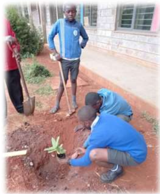
St Elizabeth Primary School held a tree planting event with the plants donated by Sisters of Mercy and the National Government of Kenya. The students were assisted by Kazi Kwa Vijana and the school's grounds men.