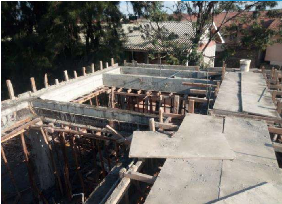
First Floor Ring Beam