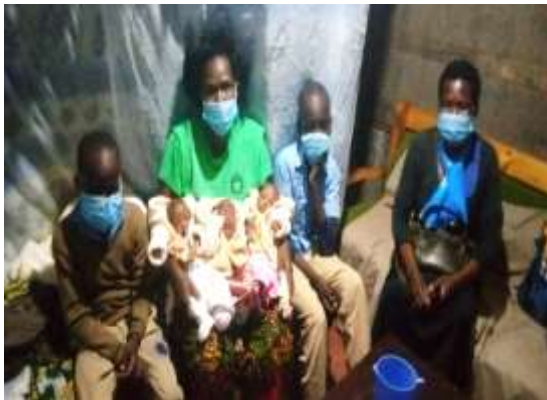
A home visit to one of our parents from St Elizabeth Primary School Who gave birth to triplets.

The 'Youth with Special Needs Mushroom Project' harvested 130 Punnets. They were delighted with their work and happy to sell their produce.