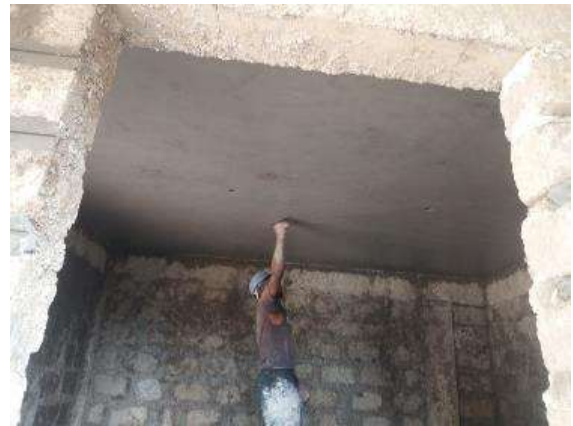
Internal wall plastering