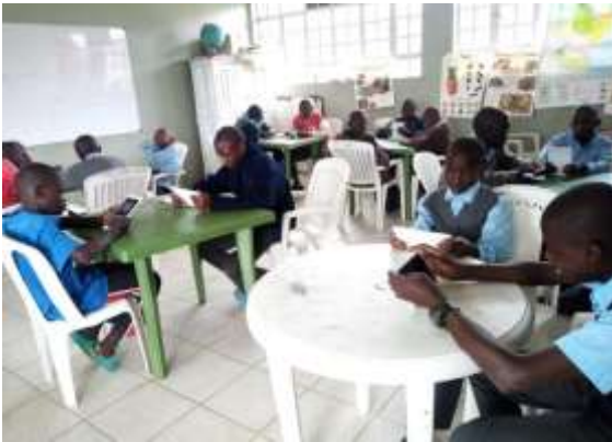
Profuturo lesson in progress

The majority of the Year Twos are responding very well in all the academic areas. Their work output is greatly improved along with their attitude towards learning. Most are able to work independently. The ones who need extra support are offered remedial lessons to help catch up on the others.