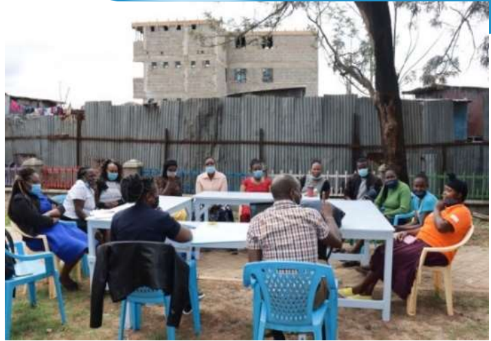
Parents meeting Needs Assessment Training

Children with cerebral palsy is the highest number of disabilities enrolled at the Centre. The Centre continues to provide training for the parents who have children living with the disability to improve their capacity on managing challenges faced each day.