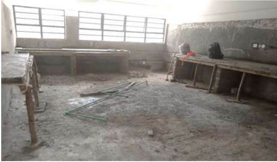
Current state of the kitchen