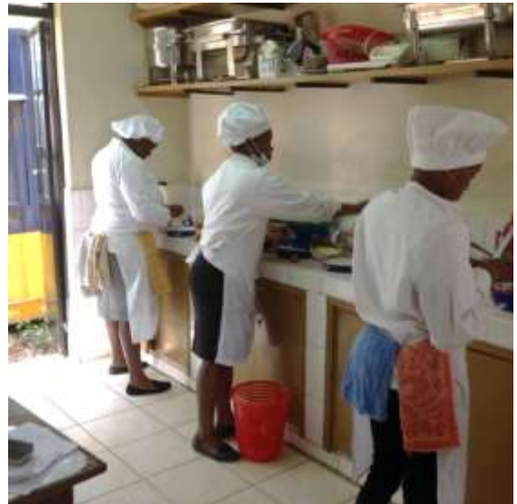
Catering students in a practical session