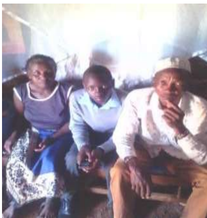
One of the boys with his grandparents

Even though CoVid19 is still with us life seems to have eased and people are going back to their normal lives. We planned the home tracing schedule for February and many of the boys were excited as they reunited after a long period of disconnection. Sadly, there was one case with a parent who denied she was the mother. The neighbours told us that they did not know she had a son and actually introduced him as her little brother who had come to visit with his “donor”. The majority of the boys are from abusive families and this is what led them on the streets in the first place.