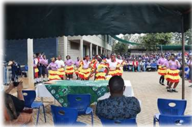
St Michael's Dancers