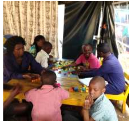
Class in session

The visitors continue to come to the Centre and bring donations of food, shoes, clothes and hygiene items. We are very grateful to people who provide basic necessities for the families.