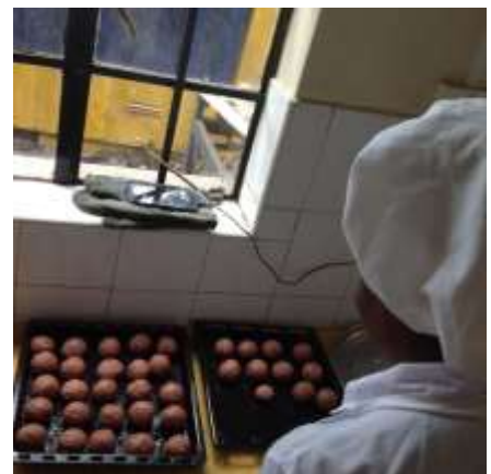
Catering students learn how to make meatballs.