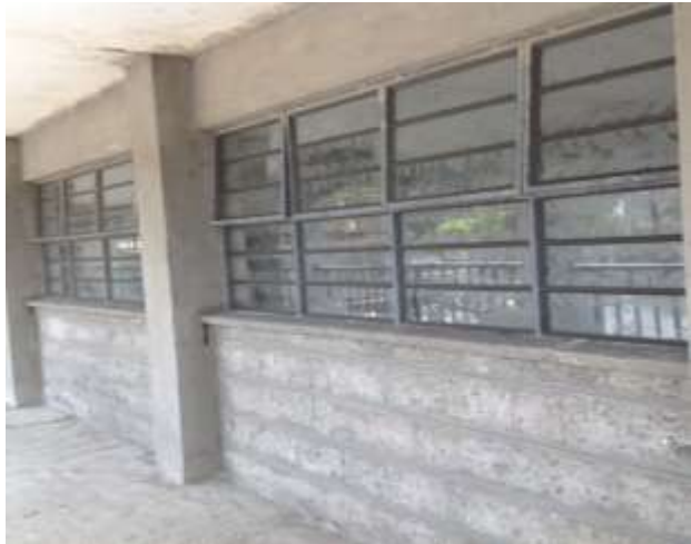
Window frames fixed - front and back of the facility.