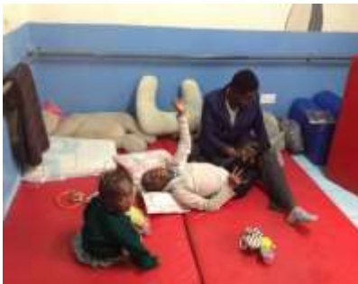
Therapy sessions taking place