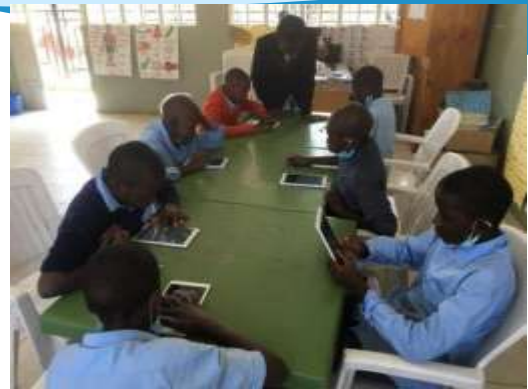
Profuturo lesson in progress

The Profuturo lessons and teachers' training have been ongoing. The teachers are able to teach the boys using the tablets and this has reduced writing in books and whiteboard. The boys are now able to learn different subjects hence have more digital literacy.