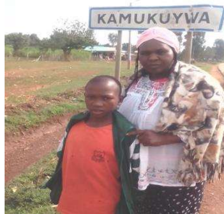
Home tracing in Kitale