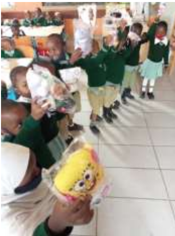
[L] St. Elizabeth Primary School (ECDE)