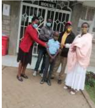
A happy reunion