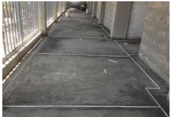
Terrazzo preparation for the corridors