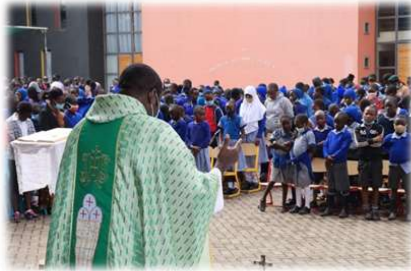
Fr celebrates Mass for the whole community.

During February St Bakhita Primary School celebrated their Feast Day and patron St. Bakhita. Josephine Margaret Bakhita was canonized on 1 st October 2000 by Pope John Paul II. She was a Sudanese-Italian Canossian religious Sister who lived in Italy for 45 years after having been a slave in Sudan. She is the patron saint of Sudan and Human Trafficking Survivors. Her witness and tremendous deeds provide inspiration to our pupils.