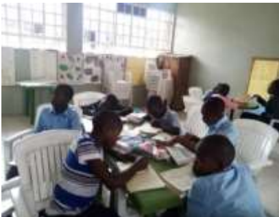
Year One Class

In year Two the boys can read and interpret statements with minimum assistance from the teacher. Their writing skills, creativity and composition have improved markedly.