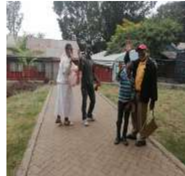
Officially back together

The social workers are now compiling their findings so that we get to know the best way to support them through his education.