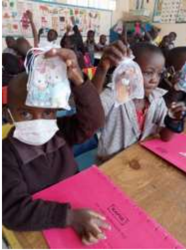
St. Catherine's Primary School (ECDE)