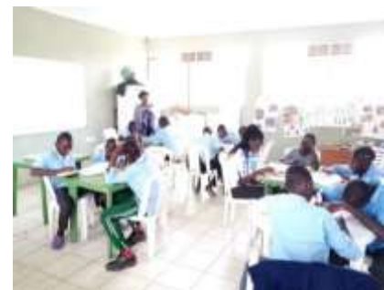
Year Two Class