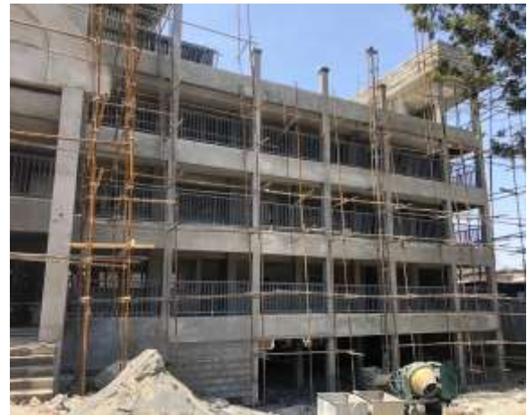
The New Facility at Songa Mbele na Masomo taking shape