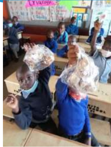
St. Bakhita Primary School (ECDE)