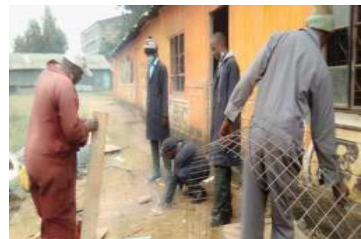
Carpentry boys at St Catherine

The carpentry class has been working on several projects. They keep demonstrating confidence in their newly acquired skills that shows they are smart and ready for their grade test scheduled in April. They assisted in the construction of a chicken coop at St Catherine's Primary School and are now working on the Rabbit Hutch for their now multiplying rabbits.