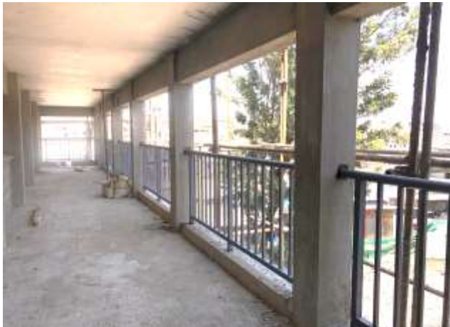
First floor corridor railings