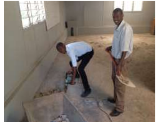
Catering classroom repairs by the Plumbing and Masonry students

The Front Office students have been learning how best to use technology for different presentations in Office Procedures, a major course in the Front Office Curriculum. The students have learnt how to present different topics in office procedures by creating PowerPoint presentations. They have also learnt how to write reports and different types of letters such as sales letters, enquiry and apology letters, application letters, memos and other forms of business letters in communication skills.