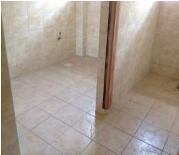
Complete tile work in the toilets

The external features of the building have been completed. For the next couple of months the internal works will be the focus. During the month the activities included tiling the bathrooms, applying the undercoats, installing the guard rails, preparing the terrazzo floors, fixing the window frames and finishing the terrace roof structure.