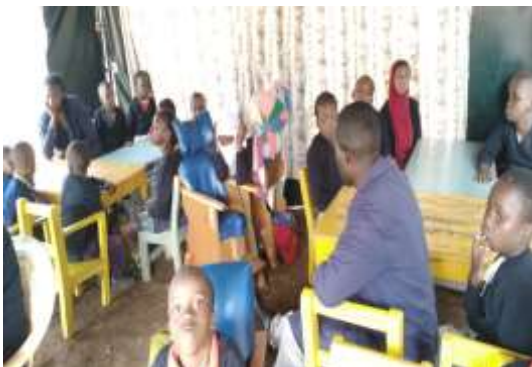
Children smartly dressed with red t-shirts and Jumpers donated by Braebun school