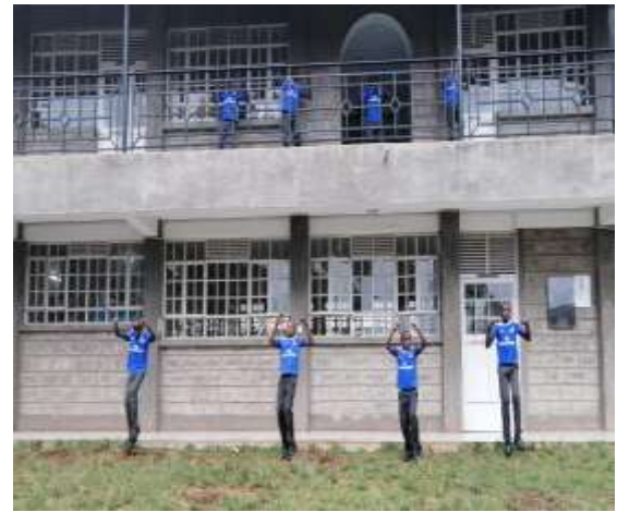
Jerusalem challenge dance

The co-curricular activities continue to play a big part in the boys' rehabilitation. With the different types of activities such as art, beadwork, yoga, acrobatics, dancing and scouting they participate in give them opportunities to develop their other talents. The acrobatics and dancers actively took the lead in recently recorded "Jerusalem" challenge dance. https://youtu.be/Ccva9RZLSUE .