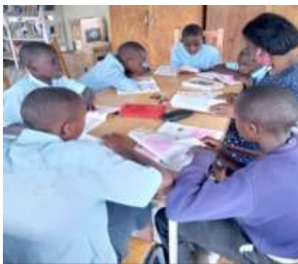
Library lessons for both Year One and Year Two

The library lessons are also enjoyed by the boys with the help of the teachers and the occasional volunteers. The volunteers have been assisting in maintaining the library.