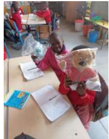
[R] Mukuru Primary School (ECDE)

The children are delighted with their 'goodies'.