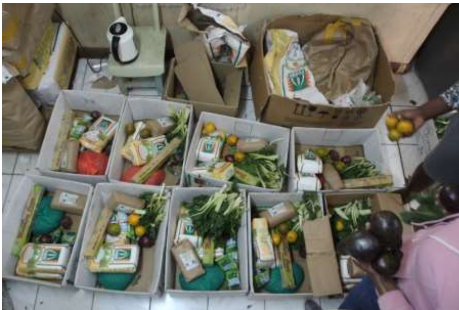
Immunity Booster Parcels

Currently, the Government has trained over 60,000 community health volunteers, who have been deployed to all 47 counties and have so far reached over 12 million households. With Counties such as Nairobi and Mombasa continuing to experience an increase with infections, most of whom are asymptomatic, the Government sought that it was only practical to have the home-based programme. The Government also announced a strategy to set up 300 bed isolation units in all the 47 counties. As at 7 th July the program had achieved the target in 23 counties. Kenya has 28 laboratories that can conduct the testing.