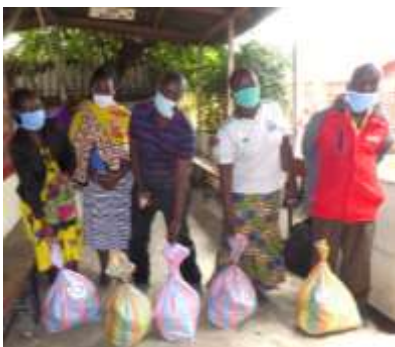
Patients receive supplementary food parcels.