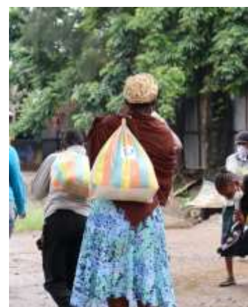
Kayaba parents receive food support