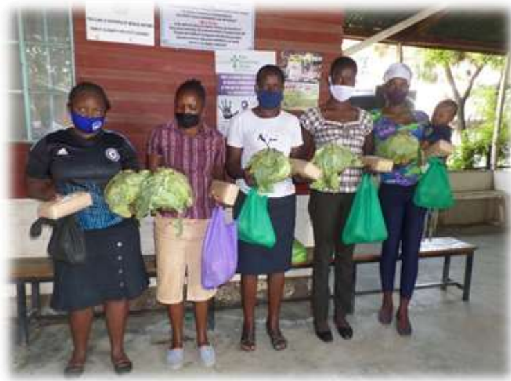
Immunity Booster Packets ready for distribution to Patients