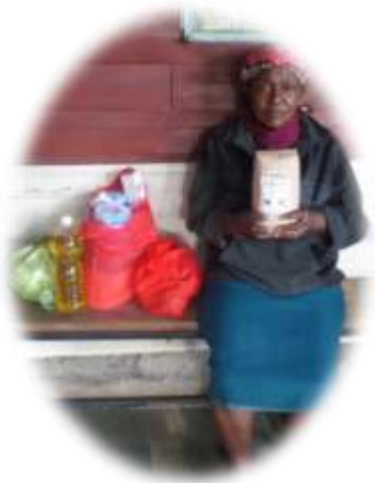
Women receive immunity booster packets and food parcels