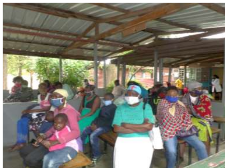
Waiting Bay at the Clinic

** Some of the items under 'other' includes baby clothes, clothes and rent for parents with disabled children.