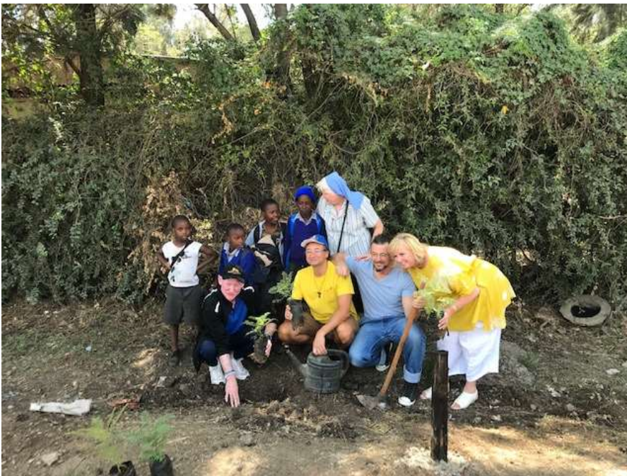
Tree Planting outside the MPC Head Office with Cuidiu members and St Bakhita Pupils