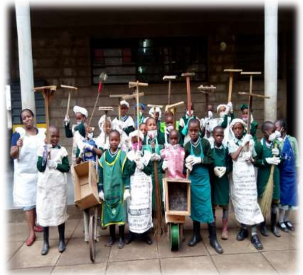
Grade 3 Pupils displaying improvised cleaning equipment.