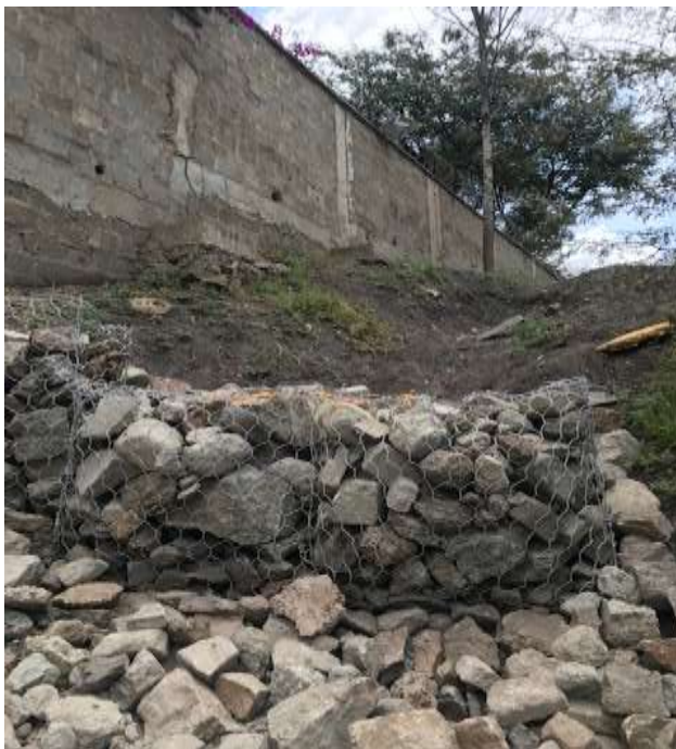
Constructing the gabions to stop landslides