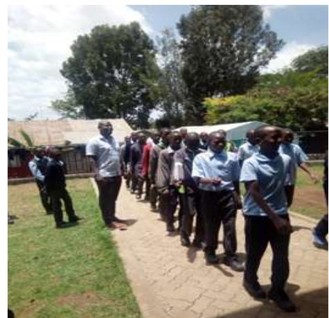
Practising Drills for Mercy Day