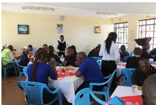
BAT staff members enjoy lunch by the catering students