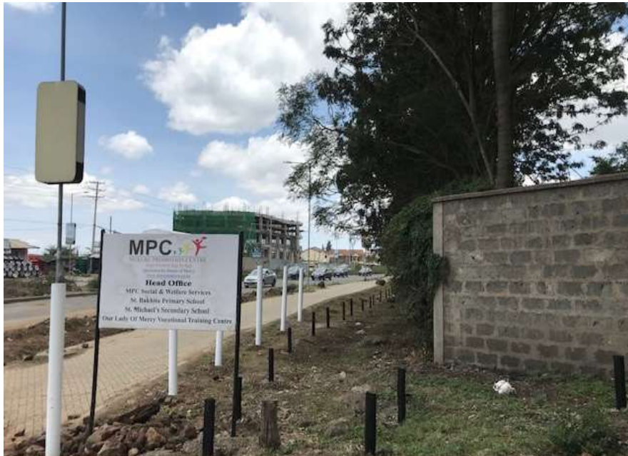
Fencing along the Head Office site to stop encroachment and protect the plants.