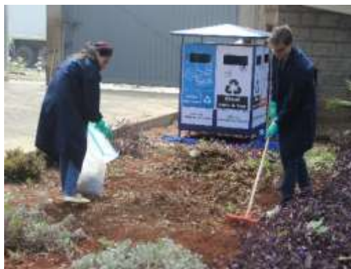
Cleaning exercise by BAT Staff members