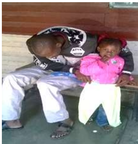
A young child receives some clothes