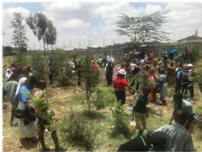
World Earth Day – Tree Planting at St Elizabeth Primary School