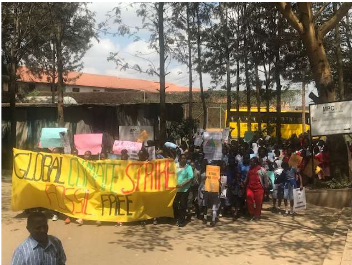
The March started from the Head Office site and walked to St Elizabeth's Primary School in Lunga Lunga.