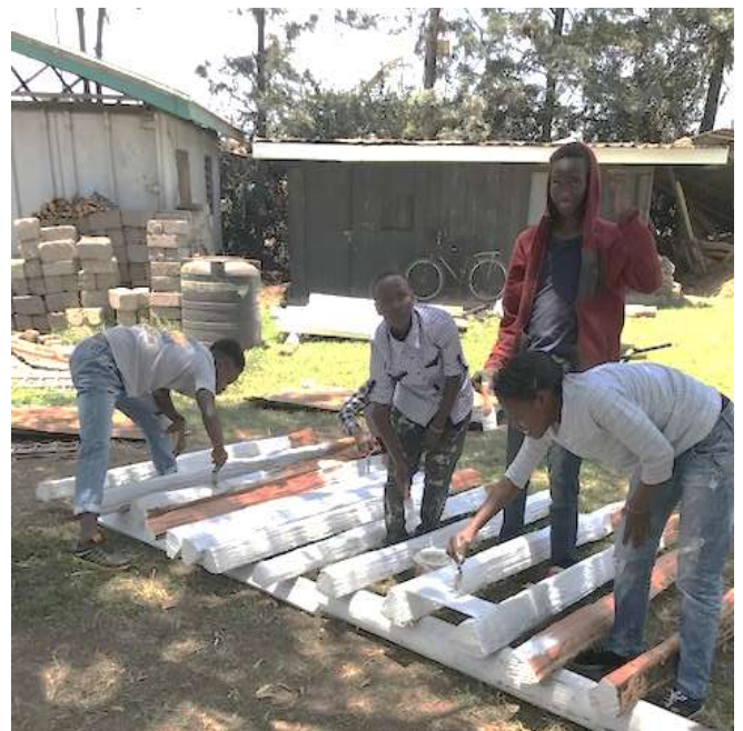
The Art students help prepare the posts.