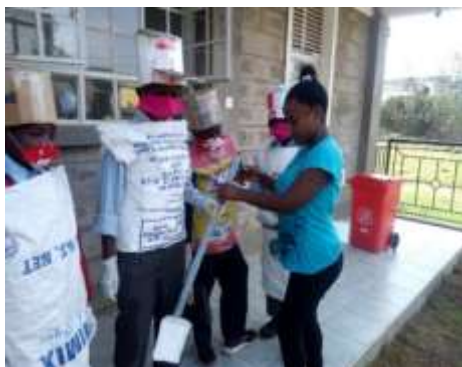
Grade 3 Assessment

The Grade 3 students made assessment tools using locally available materials. The students then carried out their project which was to clean up a market area. In conjunction with St Catherine's pupils they went cleaning South B market.