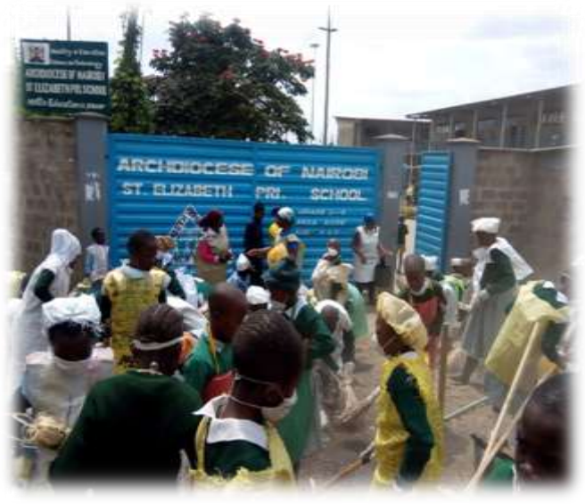
Grade 3 cleaning exercise & 'Keep the Environment Clean' campaign