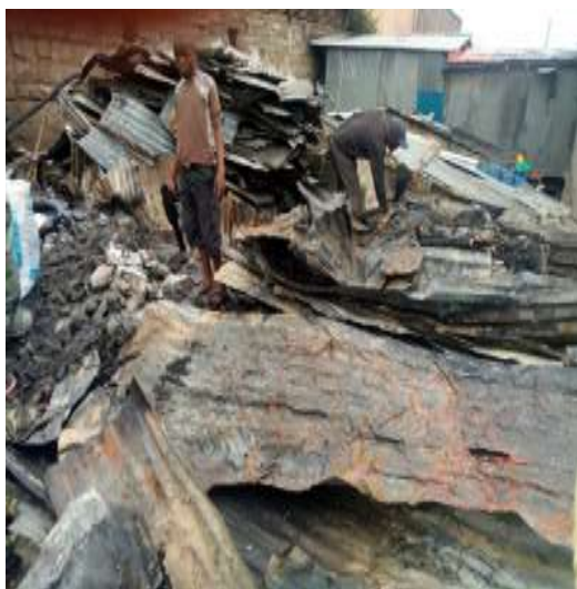
Fire out in Kayaba 20 houses affected.

There were other tasks completed due to the networking we have with other agencies. Some involve medical assistance with the Mater Comprehensive Care program at the Mater Misericordiae Hospital, Mwangaza New Life Rehabilitation Centre who specialize in drug addiction, Medecins San Frontieres (Doctors without Borders) who provide talks on various medical issues, companies who provide work placements, Star Kids who provide some mentoring for the children at Songa Mbele.