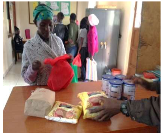
Nutritional support to clients at St. Catherine's

During the month we received donations from various well wishers ranging from shoes, clothes, bananas, sanitary pads and some stationery items. We are always grateful to people who remember the children.