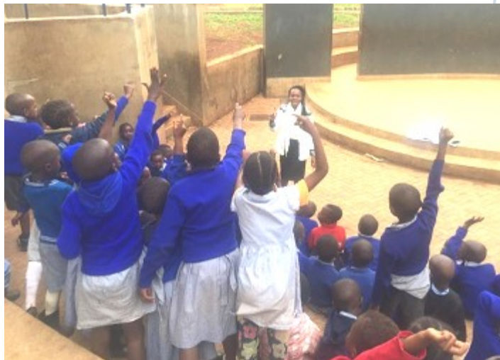
Motivational talks by the GT Wamini group and Social worker