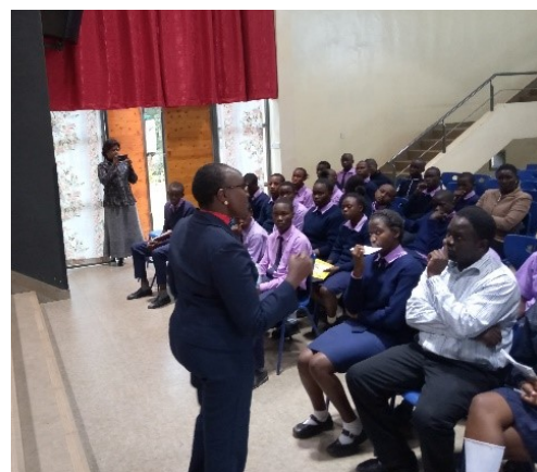
Barclays Bank Mentorship Program

The volleyball boys emerged victorious in competition and crowned the best volleyball team in the sub regional games. The win helped the boys to compete at the next level, Nairobi Regional games which were held at the Eastleigh Boys High School. The boys did well in the preliminaries. Unfortunately, most of the students were banned from playing further, due to lack of original birth certificates. Sadly, the team could not continue with their matches.