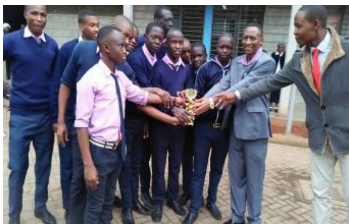
St Michael's Volleyball Team

St Michael's had a mentorship program for the Form 1 students from Barclays Bank, Industrial Area Branch. The team held an open forum with the students providing inspiration and motivational messages. Barclays have committed themselves to provide monthly mentorship meetings and to 'walk' with the learners' up to 2022.