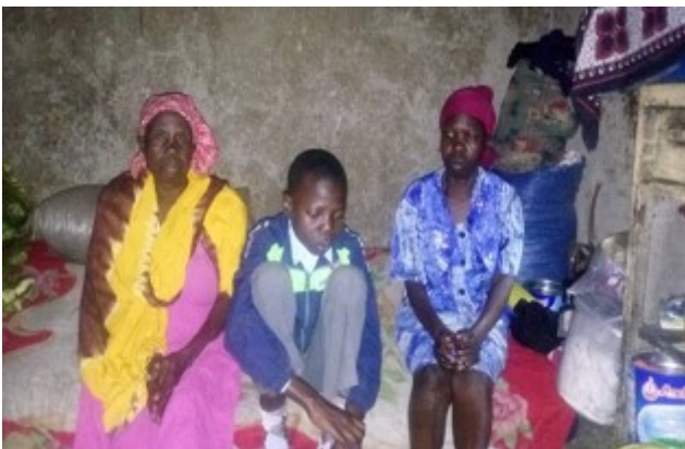
A mother who is very ill with her poor elderly mother

In each home search visit there is a similar story. It was noted that 3 boys have suffered abuse from their families and then move to the streets, thinking that it would be safer. One was a case of corporal punishment by the grandmother; the other a case of sodomy which was dismissed due to lack of evidence (neighbors refused to testify) and so the perpetrator was let free and the third was a case of child labor due to poverty level being high and so the child went looking for ways to feed himself. These stories unfortunately are far too common for those who live in poverty and are denied their rights.