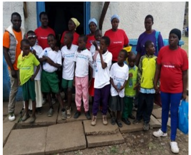
Parents, teachers and children during the Special Olympics

To further improve their skills the children in Special Coaching class, attended a Special Olympics - Young Athletes event held at St. Paul Primary School. This is a great initiative which aims at giving the children a chance to nurture their talents.