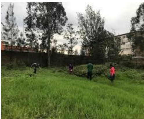
Staff measuring the field

As mentioned in the newsletter, Sancta Maria College students and staff visited MPC. The group travelled to Chepareria in the North, Mavoka in the South East and Nairobi Central. The students spent time at each of the MPC programs and engaged with the different groups. They come every 2 years and we love to see them. They will be supporting various projects at MPC: environment, education, talent development, social rehabilitation, special education resources and medical support for poor families.