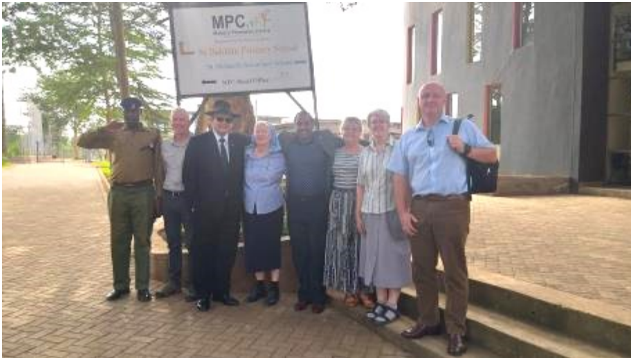
Northern Ireland Mission for Africa with local police representatives

Crime in the informal settlement is on the rise and skills students are no exception. Our aim is to ensure our students are prepared morally, ethically and skills wise, hence we have put a consensus effort to ensure we provide moral and ethical classes on Tuesday and Friday afternoons.