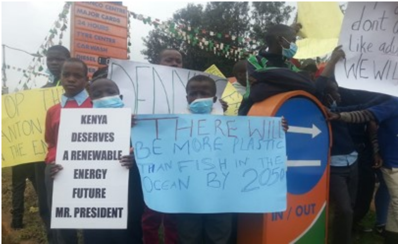
Raising Awareness on Environmental Issues

Other activities during the month were the motivational talks given by the MPC counselor on anger management attended by the Standard 7 Class boys. Good behavior management is very helpful for the boys as well as an enjoyable learning experience.