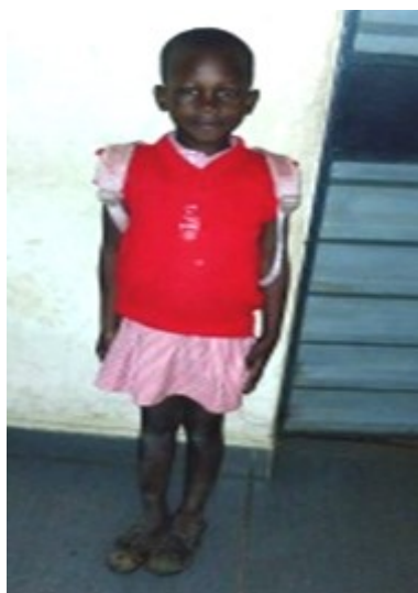
A Mukuru Primary pupils before and after receiving her new uniform.