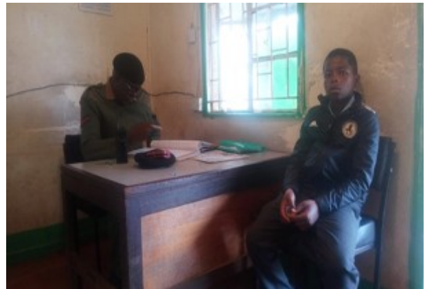
Trying to trace through the Chief but in vain

The Mercy Education office sponsored 32 boys to attend the celebrations marking ‘ The Day of African Child ’. The ceremony was held at Rongai, just outside the city, and the main theme for the function was ‘ Preserving the Environment ’. The day was filled with entertainments, dance competitions and games.