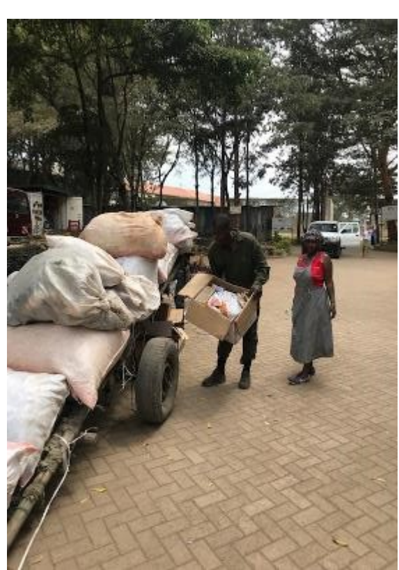
Recycling Program underway