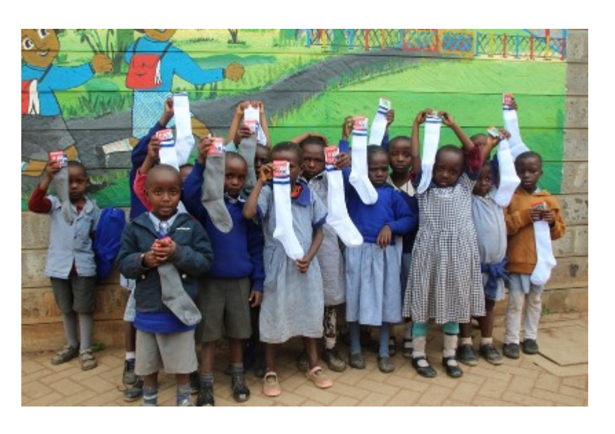
St Bakhita ECDE children who received some new socks.