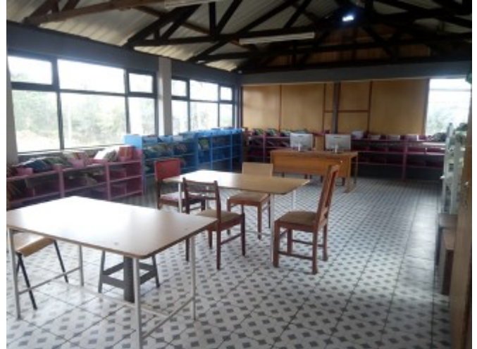
The Rehab Library