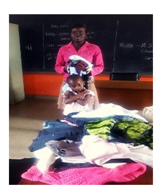
A resident receiving a donation of clothes