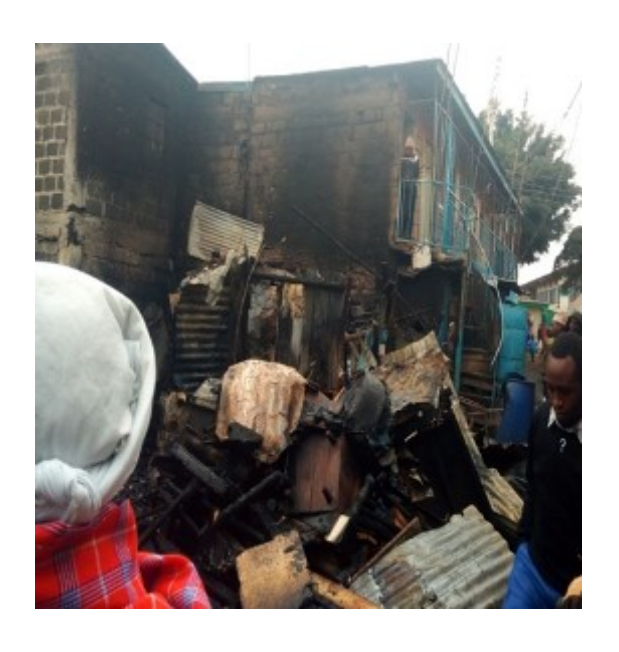
A fire outbreak in Kayaba village.

The ongoing saga on birth certificates continued. The parents were assisted by the social workers to apply for the birth certificates so that the children can be registered for national exams.