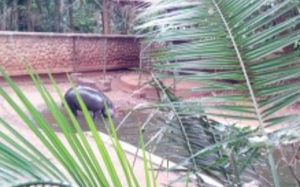
Baby Hippo at Mamba