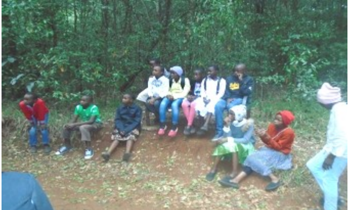
The coaching unit class during their visit to Karura forest sponsored by Star Kids Initiative