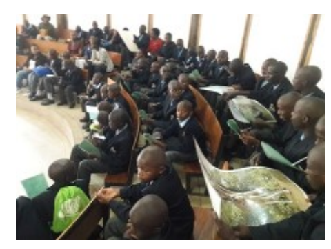
The MIRC Boys at the Giraffe Centre