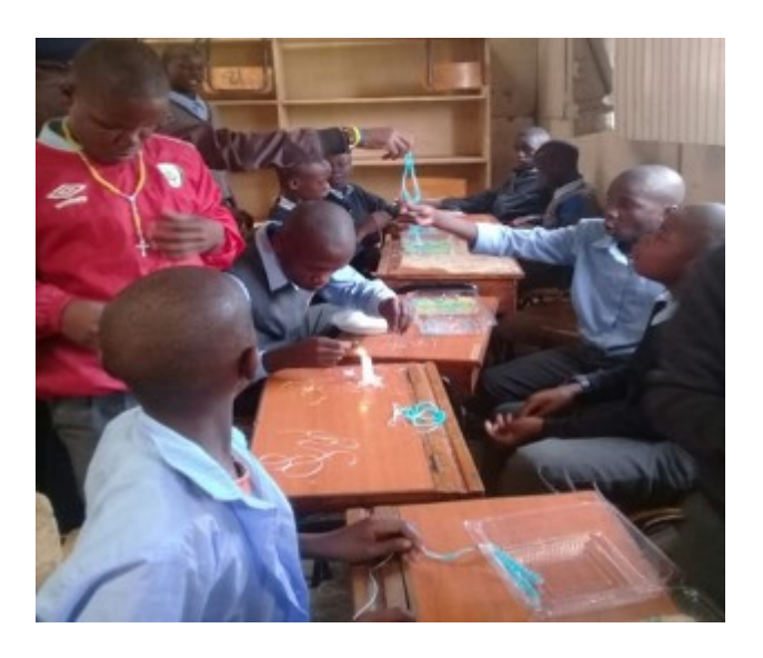
Rosaries made by the boys during their creative arts sessions