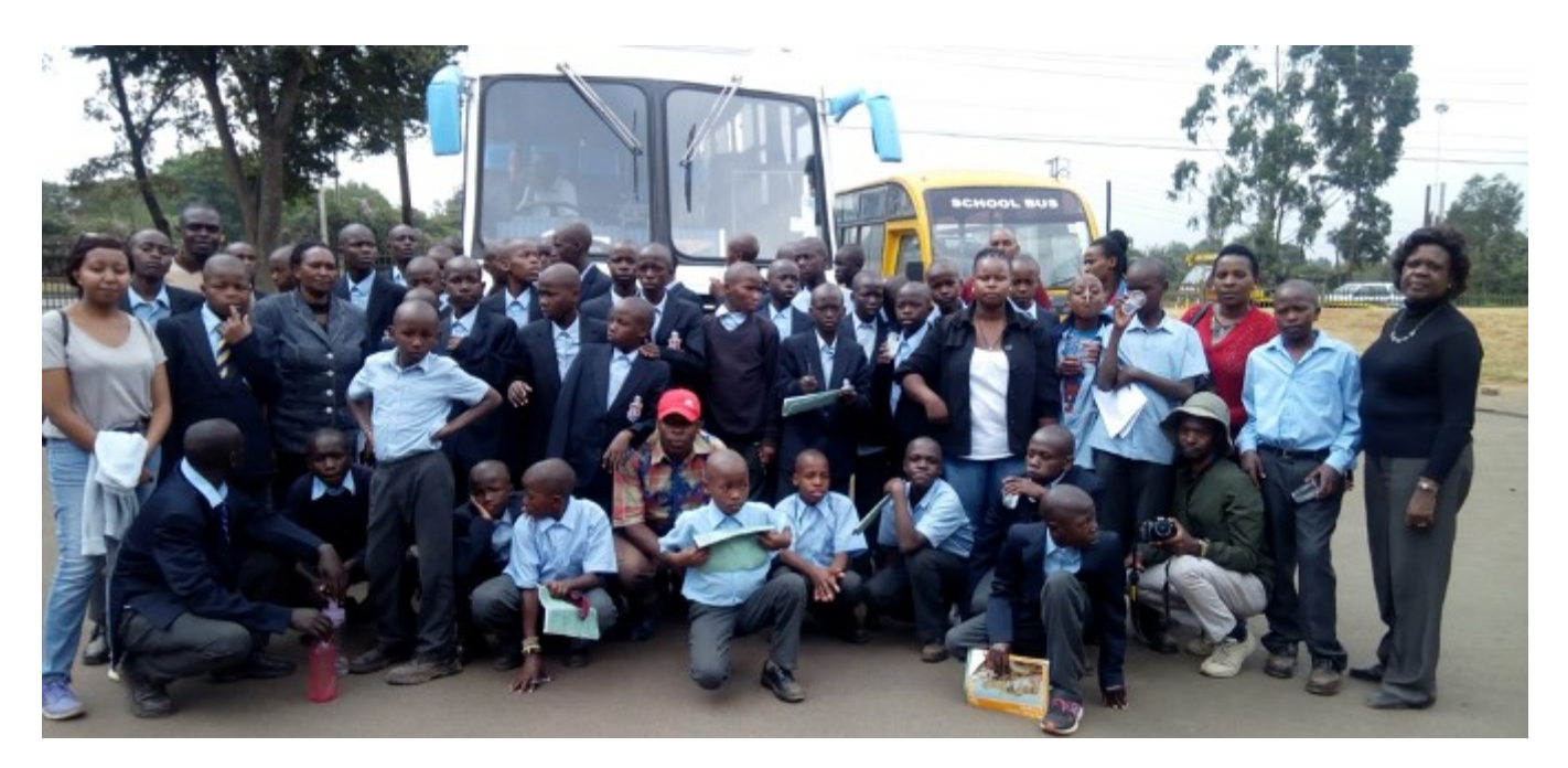
MPC Staff and MIRC Boys