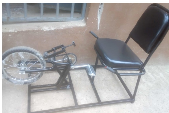
Equipment donated by Rosslyn Academy