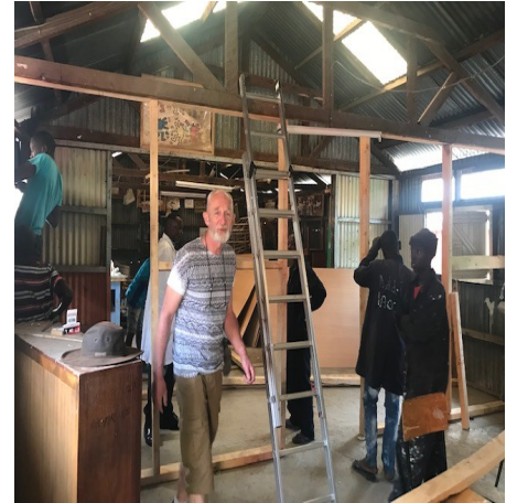
Partitioning of the old classrooms to be used as a dormitory