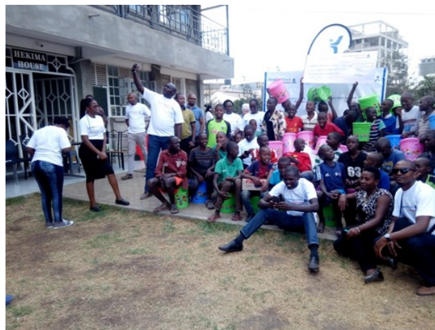
Metropolitan Cannon group with the Staff and boys at the Centre

The water tanks were put on the newly built platform at the Centre for water harvesting during the rainy season. Now that the rains are here, we will be able to harvest enough water for use around the centre thus reducing our water bill.