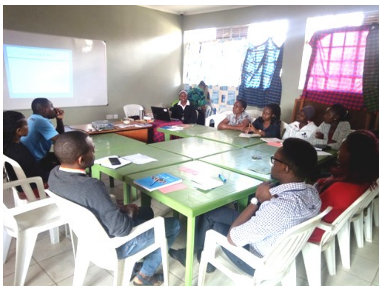
Child Protection and Safeguarding training for MIC, MIRC and Songa Mbele staff

As with all the other departments at MPC, the Rehab staff were trained on Child Protection and Safeguarding during the month.