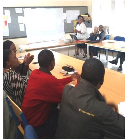
Child Protection and safeguarding training for teachers at St. Michael Secondary