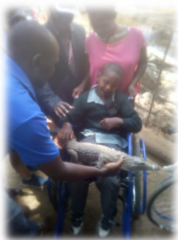
Songa Mbele Children at the Mamba village