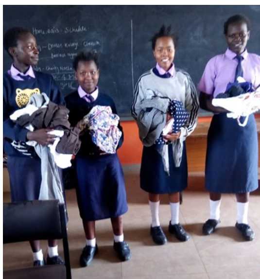
Girls received some clothes donations